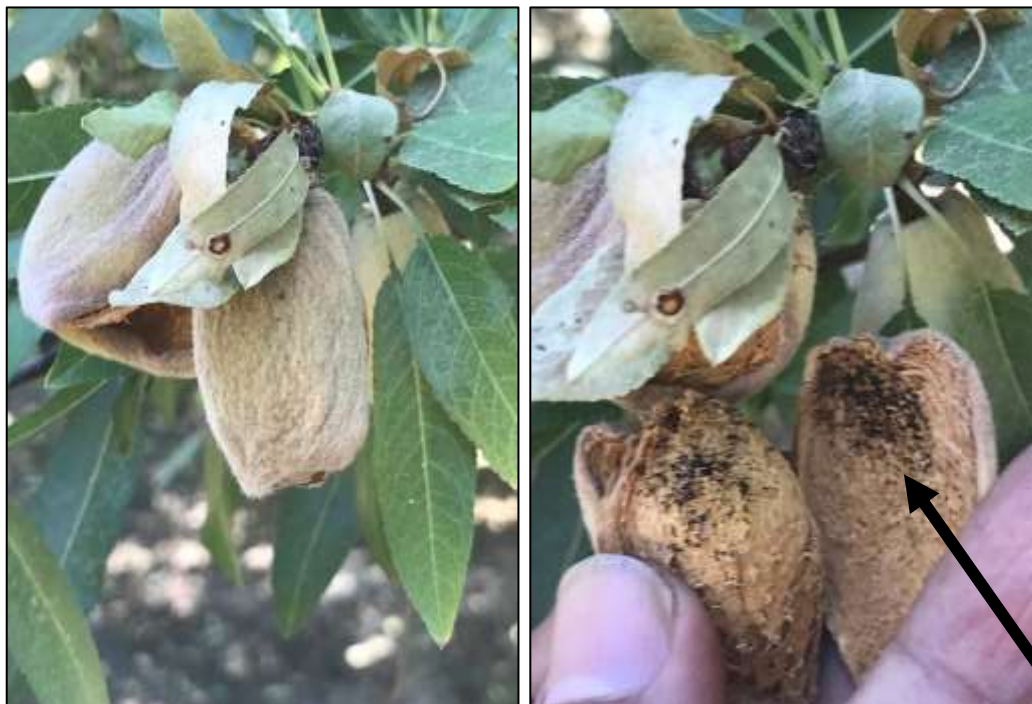
Figure 3. Symptoms of hull rot caused by Aspergillus niger . Flat, jet-black spores are present in-between the shell and the hull.