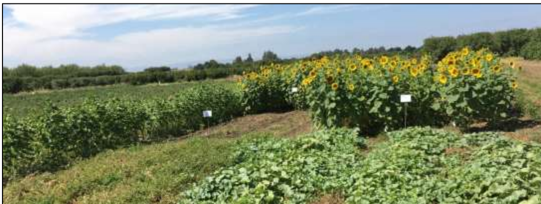
Figure 3. Warm season field trials evaluating Fusarium wilt of tomato pathogen loads following incorporation of infected rotation crops.

In addition to crops, previous studies of the tomato Fusarium wilt pathogen in Israel have shown that several weeds, including Amaranthus , Chenopodium , Digitaria , Malva and Oryzopsis spp. can host the pathogen. Knowing which weeds host the pathogen can be helpful in identifying weeds to target for management, especially in organic production where weed control is often a significant challenge and economic cost.