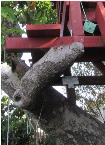
Physical damage from kids clambering around in a tree

There are a number of causes for the white exudate from cankers on the trunk and limbs of avocado. Any wound will cause the tree sap to run and crystalize on the surface. It is a seven-carbon sugar of mannoheptulose, or its alcohol form perseitol. It's sweet. The leaking sap is the tree's attempt to staunch the wound (More about the sugar can be found at: https://www.sciencedirect.com/science/article/pii/S0254629911001372 ). Any wound that might be caused by woodpeckers, pickers or little kids climbing the trees will damage the bark, and where the damage has occurred, the sugar will form. So fire damage can cause wounding and so can insect infestation like shot hole borer. Any wound will cause the sugar to leak out in a response to heal the damage. This sugar exudate is a sign of health in the tree, showing that it can respond to attack/infestation/disease. No response is a bad sign.