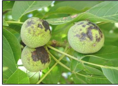
Photos 4 & 5: Walnut fruit with “end blight” and “side blight”, respectively.

For attempting to predict or forecast walnut blight, utilizing orchard history, bud monitoring and Xanthocast are the three methods (Table 1). All methods have advantages and disadvantages and should be used as information to guide the grower/PCA decision-making process for implementing a preventative management program.