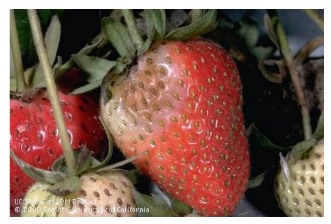
Early stage of Botrytis fruit rot on strawberry.