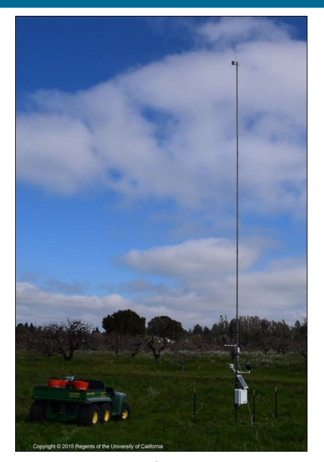
UCCE Inversion Tower

Ideally this assessment would be done for several years prior to the initial development of a property, but it can be done at any time provided that the current frost protection activities do not disrupt the natural temperature conditions. This type of measurement can also be added to existing weather stations to provide the farmer with real-time information on the inversion conditions, which may help guide their responses to frost conditions.