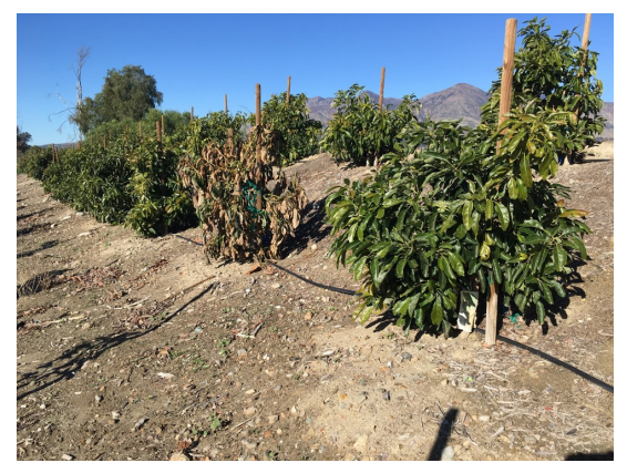
Spotty frost damage to avocado trees this winter. Not enough to kill, but enough to pay attention.

We had the annual CA Avocado Society grower meeting in October, with about 150 in attendance. We had a group of Israeli irrigation scientists tour the area in October, as well. In November, we convened at UC Riverside to interview candidates for the Citrus Specialist position who will focus primarily on horticultural practices with attention to methods to reduce the impact of Huanglongbing (Citrus Greening) which is beginning to affect trees in the Orange, Los Angeles and Riverside County areas. So far the disease has not been reported in Santa Barbara County, although there have been finds of the Asian Citrus Psyllid which carries the disease-causing bacteria. In October, we began the monthly "UC Ag Experts Talking" webinars which provide Continuing Education Units for growers, farm managers and Pest Control Advisors. These webinars provide a range of topics that qualify for CA Dept Pesticide Regulation yearly training requirements for ag professionals.