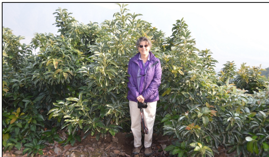
Figure 2. Ultra High Density Planting (4x4; 2700 trees per acre) in a Chilean orchard (Mexicola x Hass) planted in 2013. Look how crowded, compact and shorts the trees are next ML Arpaia. Production in 2015 was 17,000 lbs. per acre.