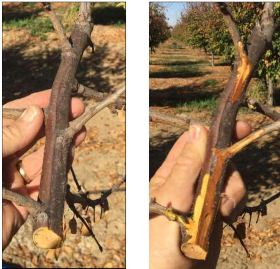
Figure 1. A clearly delineated Cytospora canker (brown dead bark; pruning wound infection) in young prune orchard with widespread infection (fall 2018, photo by Franz Niederholzer).

Cytospora is a major pest of prune trees, killing bearing wood, reducing yield potential and even killing trees. It is a fungal canker, meaning a fungal disease of the bark (see figure 1). This canker disease is perennial, so once the fungus has successfully infected the bark, it can continue to grow every year, resulting in branch girdling and even tree death. This disease is widespread in prune orchards in California. It is present, to some degree, in every mature prune orchard the authors have ever visited. To minimize damage from this disease, several important steps must be taken.