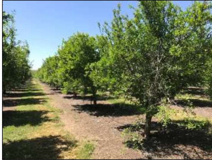
Figure 1. A 15-year-old orchard that has been mechanically ‘boxed’ for seven years showing branch dieback (tree on the right). The orchard manager had not previously protected pruning wounds with a fungicide but plans to start this year.