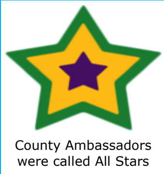
County Ambassadors were called All Stars

The state 4-H office created a video designed for youth members who are or want to be County Ambassadors and their Coaches. It gives a brief overview of the program and a quick walk-through of the County Ambassador Handbook. It's about 14 min long. http://4h.ucanr.edu/Projects/Leadership/County_Ambassadors/