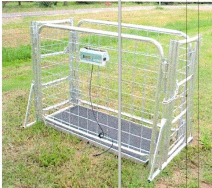
A&A portable digital scale Purchased: June 2014 Cost: $735.00