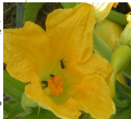
Cucumber beetles on a squash flower Alabama Cooperative Extension IPM