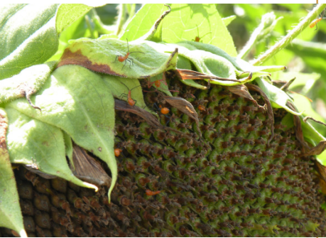
Leaf-footed bug nymphs on sunflower Alabama Cooperative Extension IPM

Alabama Cooperative Extension specialists have been studying leaf-footed bug management in tomatoes since 2010. Extension entomologist Ayanava Majumdar has found that the sorghum variety NK300 and Peredovik-type sunflower, when planted around a perimeter, make for effective trap crops in controlling the leaf-footed bug in tomatoes.