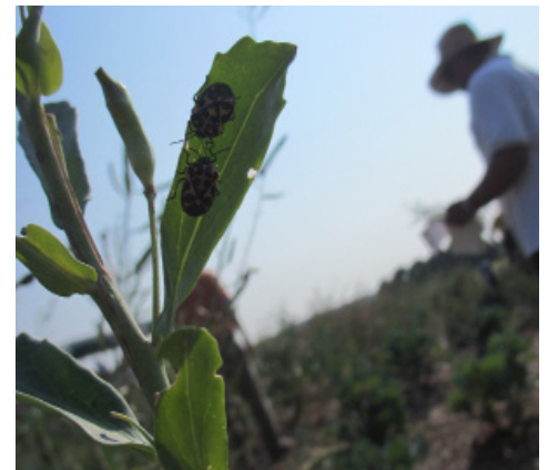
Harlequin bug