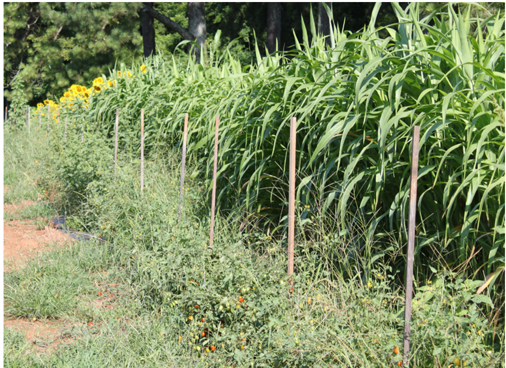
Rows of sorghum and sunflower line the edge of a crop field in Muscle Shoals, AL. The trap crops protect tomato plants from the leaf-footed bug, says Alabama Cooperative Extension entomologist Ayanava Majumdar.

Learn more about SARE by visiting http://www.southernsare.org