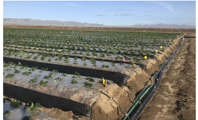
Strawberry study evaluating fertilizers, biostimulants, and beneficial microbes for improving crop health and fruit yield