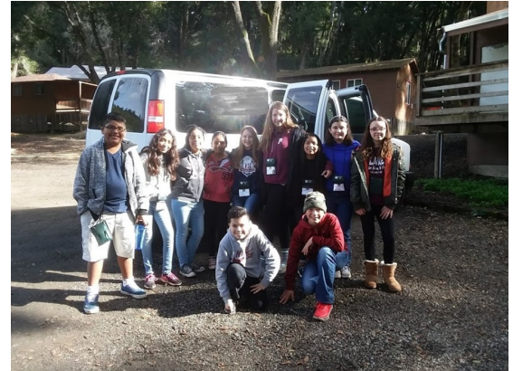
Youth from Bruce Elementary School and La Graciosa 4-H Clubs attending the 4-H Youth Summit