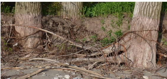
Buried Avocado Trunks from Debris Flow, Carpinteria