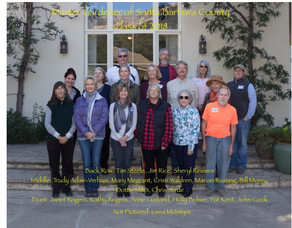
Members of the Santa Barbara County Master Gardener Training Class of 2018 began their 20 weeks of instruction on January 9, 2018. They are pictured here at the Santa Barbara Botanic Garden.

Master Gardeners devoted a total of 650 volunteer service hours to educational outreach during this quarter, representing a contributed value of $18, 564 to the County of Santa Barbara.