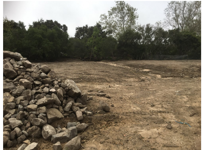
Destruction of the 4-H Playa Del Sur's livestock facility in Carpinteria

Our mission is to extend research knowledge and information to empower people to improve and enhance their lives. We represent a unique partnership between the University of California, the County of Santa Barbara, and the United States Department of Agriculture.