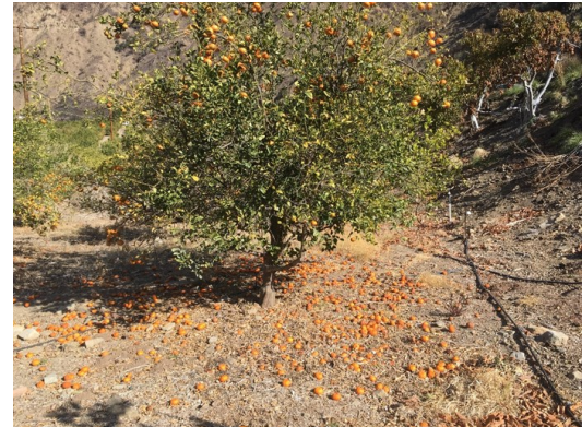
Smoke impact on mandarin fruit drop, Carpinteria

Organized an avocado grower meeting on Biological Control in Avocado, attended by 78 growers.