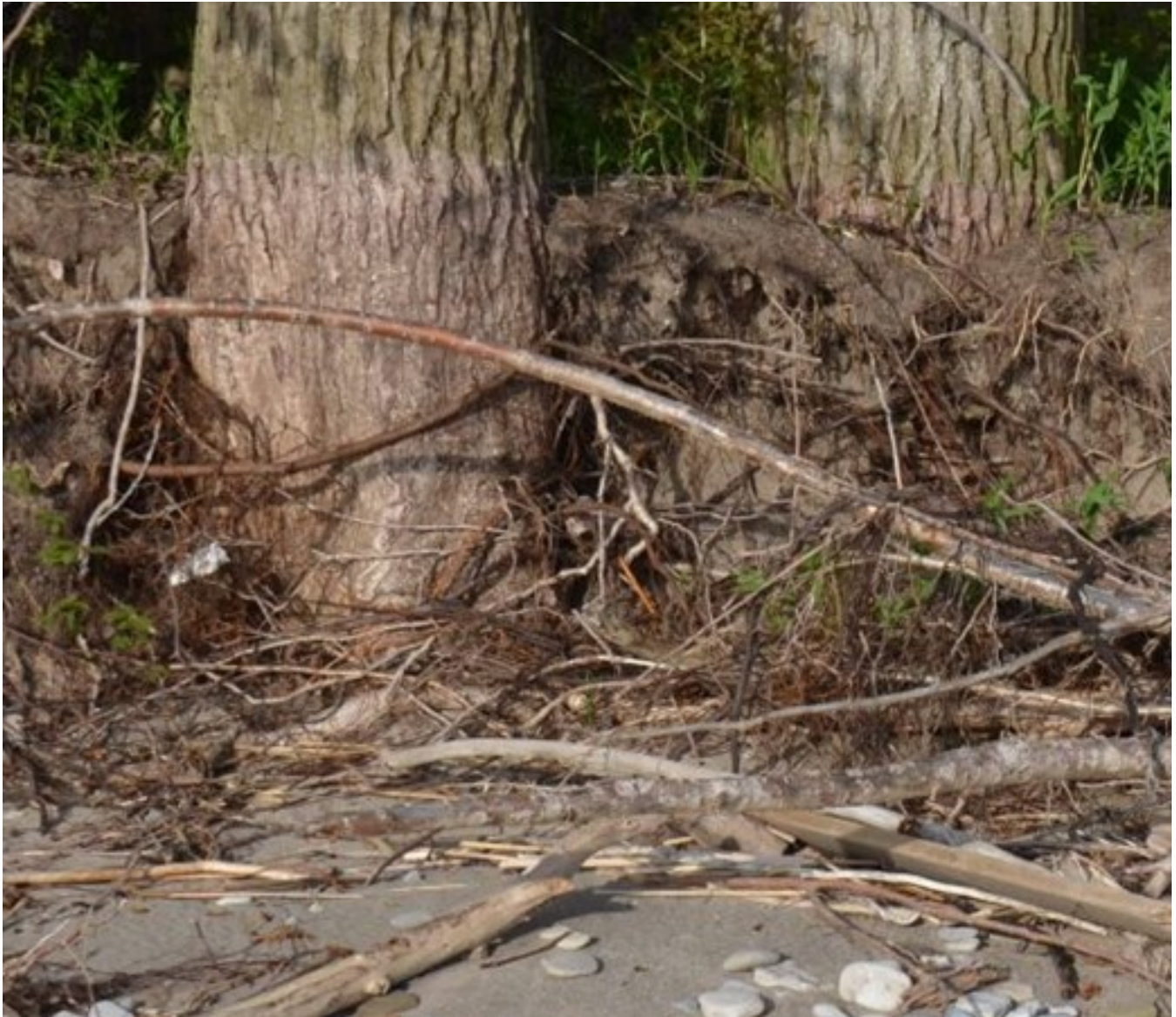
Markers of debris flow, which buried avocado tree trunks during flooding in Carpinteria, CA