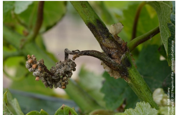
Downy Mildew infection of a grape flower cluster in the Santa Maria area in 2017

Control measures include copper sprays and various fungicides which are not routinely used on grapes in most of California. Most vineyards in the region, particularly in the more inland areas, are not likely at risk for this disease and thus applying preventative sprays does not appear warranted based on current knowledge. Coastal vineyards in areas where the disease was observed in 2017 are better candidates for including Downy Mildew control products.