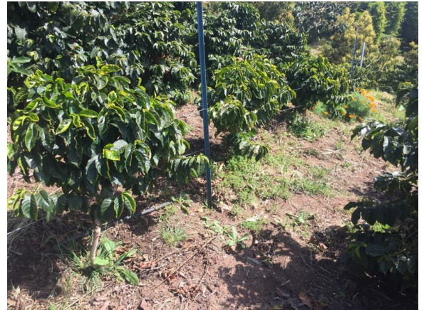
Additional new Santa Barbara County field trials evaluating coffee production with plants trained on wire trellises are focus of new coffee research collaboration with NASA-Ames.