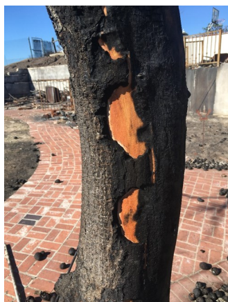
Fire evaluation, Carpinteria