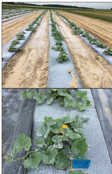
Kaolin clay was sprayed to butternut squash to confuse cucumber beetles.

Cucumber beetles are difficult to control, and when bacterial wilt spreads, treatments are hardly effective. Therefore, most controls focus on preventing outbreaks of cucumber beetle