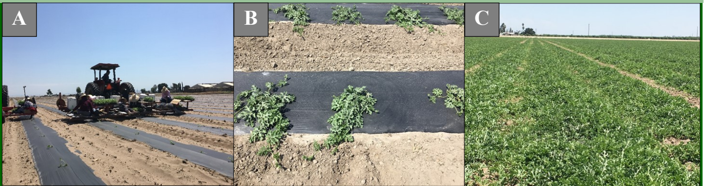
Growth stages for melons are diverse. Images taken on May 15, 2018, by Dr. Zheng Wang showed different growth stages of watermelons for one grower ranging from transplanting to setting fruit (A to C). Photo permissions given by the grower.