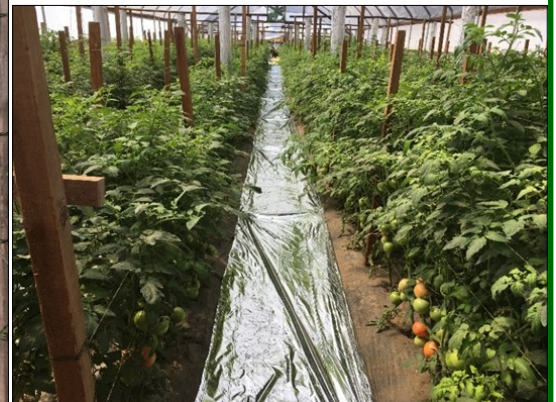
Tomatoes in the hoop house are either under harvest or close to harvest.