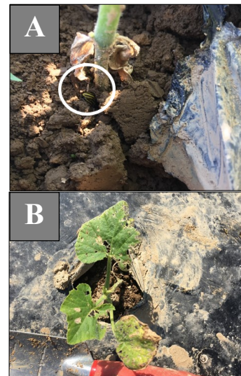
Adults typically come out of soil (A) and cause leaf feeding damage (B).

If you have questions, need more details, or have concern about your plants, please contact me ( zzwwang@ucanr.edu ; (209) 525-