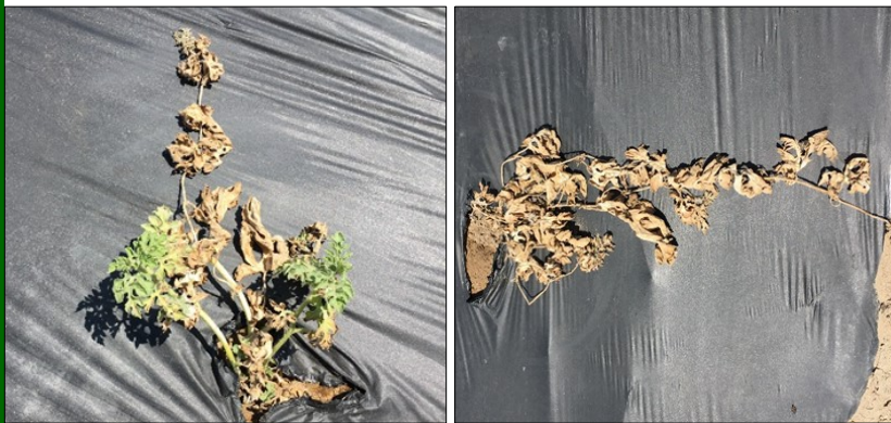
In May, growth disorders of some newly transplanted seedlings start to emerge. The young watermelon plants on the left are suspected to suffer from pre-emergence herbicide residue. Photo permissions given by the grower.