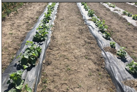
A: Transplanted on April 2

Stagger transplanting (A, B ,C) allows growers to harvest at different times and keep them in the market longer. The images taken on May 15, 2018, by Dr. Zheng Wang showed that organic cucumbers were transplanted at staggered schedules. Produce from the same farm will enter the market at different times to elongate supply. Photo permissions given by the grower.