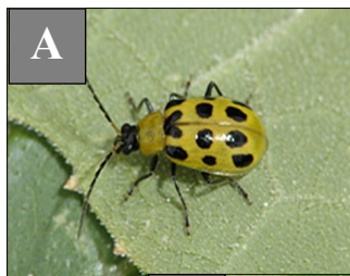
Spotted (A) and striped (B) cucumber beetles. Jeff Hahn, University of Minn.

Type and Identification. There are two species of cucumber beetles known in California (Western Striped and Spotted) and both are major threats to cucurbits. Adults overwinter under leaves, debris, and structures, and become active in