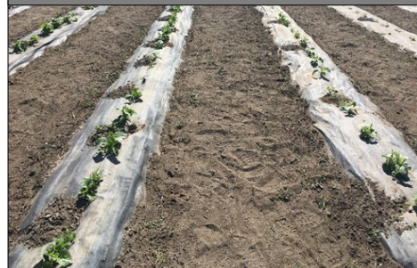
C: Transplanted on May 4