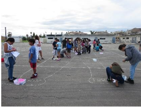
Students planted a cultural garden for Shaping Healthy Choices Program. The new program led to a new school garden, increased nutrition knowledge, and enhanced partnerships—collaboration of Master Gardener program and Schools