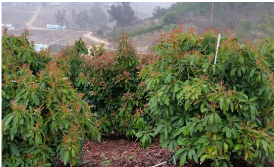
Subtropical horticulture and Farm Management: Mitigating the high cost of water in southern California avocado production: High density planting trial is being evaluated for effects on yield, irrigation water use efficiency, pruning, returns and production costs.