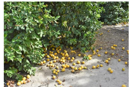
Excessive lemon fruit drop in the Coachella Valley; collaborative research is ongoing to determine the cause. The subtropical horticulture advisor is conducting grower survey to assess production practices.