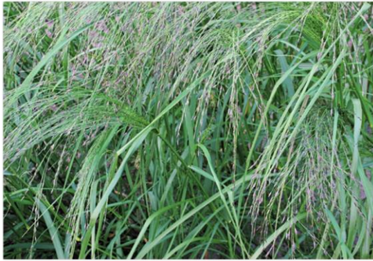
Palo Verde Valley, Crop Production Program Pest management is one of the major focus: Here the advisor is conducting trail to answer questions from producers if insects are reducing seed crops of new forage grasses such as Teff.