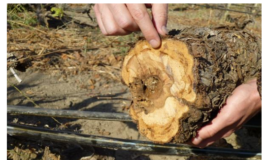
Evaluation of strategies to protect young grapevines of Canker Disease, the viticulture advisor is working to develop protocols.