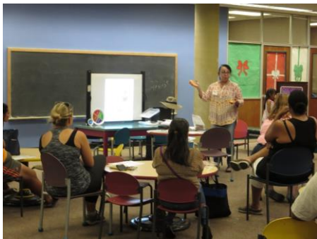
Adult EFNEP/UC CalFresh: Direct Ed -Reaching ~1,000 adults/yr-Participants learn to: Plan nutritious meals Increase physical activity Stretch their food dollar Practice safe food handling Prevent obesity through healthy lifestyles.