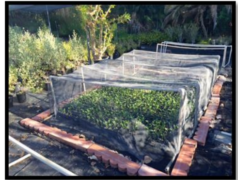
260 Master Gardeners Volunteers (67 Master Gardeners in Training); Statewide county average is 120 volunteers 21,780 volunteer hours; statewide county average is 7,700