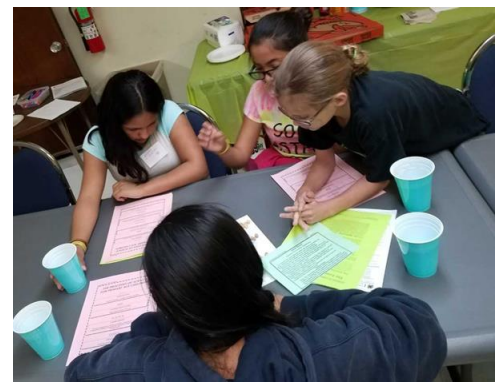
Youth Experiences on Science