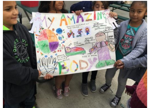
Youth EFNEP/UC CalFresh: Direct Ed -Reaching ~10,000 youth/year -Youth acquire the knowledge, skills, and attitudes to choose nutritionally sound diets. -Students learn to: develop healthy eating habits-choose healthy snacks; increase physical activity; practice handwashing