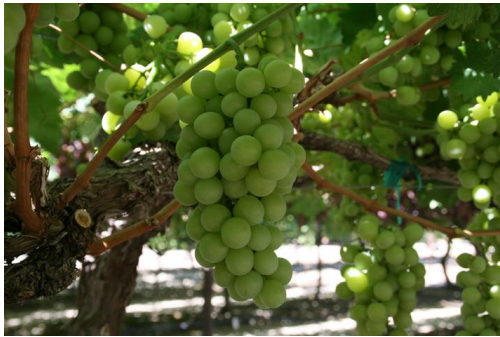
Viticulture varietal selection: The viticulture advisor in collaboration with USDA evaluated 9 USDA advanced selections: 4 green, 3 reds and 2 blacks (all seedless). Long term project resulted in Valley Pearl, early green registered and available for early marketing and attracting high returns.