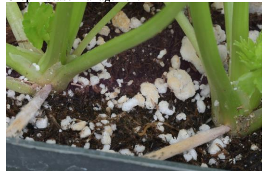
The vegetable crops program continuously tackles crop diseases to save crop losses: Here the advisor is showing diagnosing celery diseases: Fusarium culture inoculation—recommendation grower improves transplanting practices.