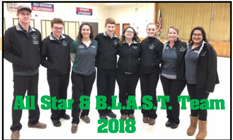
All Star & B.L.A.S.T. Team 2018

Thank you Plaza 4-H members, volunteers, and leaders for chairing the 2018 Livestock Challenge!