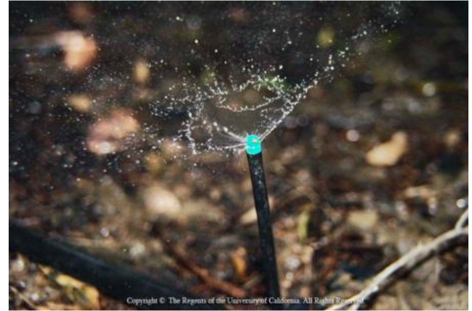
Micro spray head with irrigation