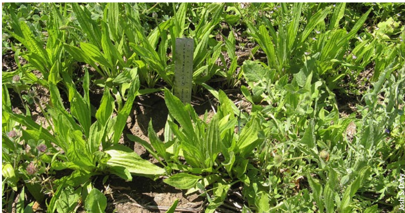
Tonic plantain, a perennial herb, at the end of the first growing season. Trial results suggest that the herb species are best utilized as short rotations before another crop or when high quality forage is needed for the short term.