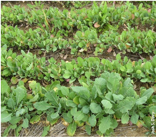
The annual herb Winfred forage brassica should be considered a single-season crop due to its lack of seed production.

al. 2008; Sanderson et al. 2003; Wiedenhoef 1993) but not in California.