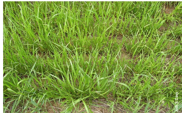
Gulf annual ryegrass established vigorously during its seeding year (April 2010).