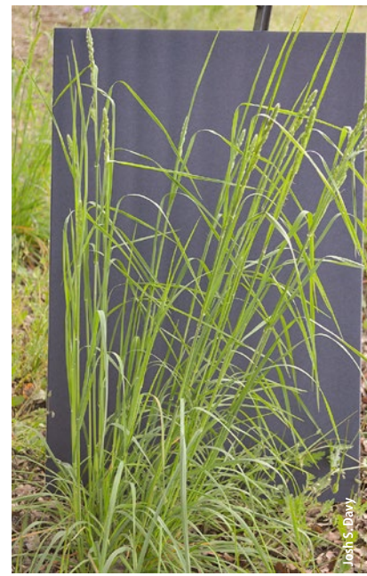
Established Berber orchardgrass (May 2013). By 2014, the Berber grass plot was almost 3 times more productive than the unseeded control plot. In addition, of the three orchardgrass varieties tested, only Berber survived the hot, dry summer.

Soil type did not contribute to significant differences in cover across varieties seeded in 2009 ( p = 0.25 ) or for varieties seeded in 2010 ( p = 0.12 ). However, some varieties demonstrated idiosyncratic differences in cover in response to the different soil types through time. For example, the orchardgrasses Berber and Paiute both demonstrated significantly lower cover on Tehama soil than on Arbuckle soil (a 15% difference in cover for Berber and a 28% difference in cover for Paiute). There was also no difference between the cover of annuals (mean cover = 40.73%, SE = 12.8) and perennials (mean