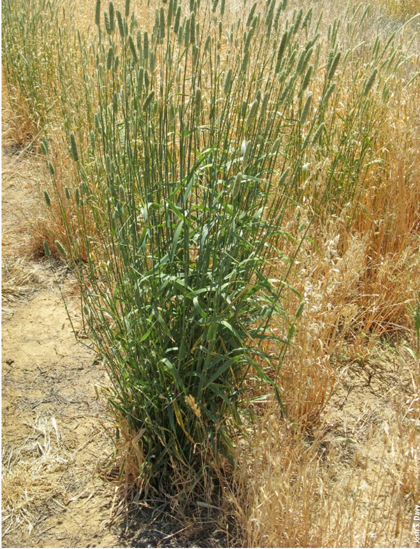
Holdfast hardinggrass, a perennial developed in Australia, proved to be a viable replacement for Perla koleagrass if Perla seeds are not available.