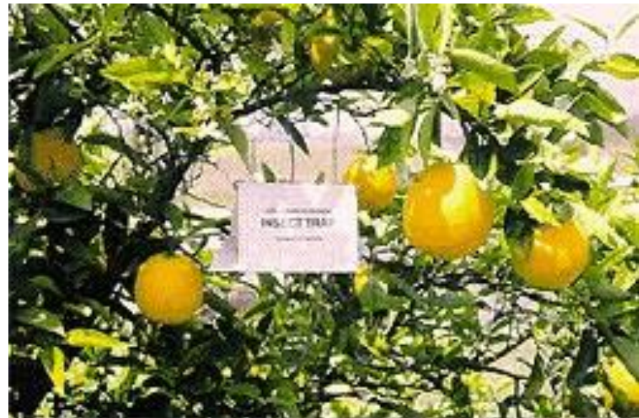
Jackson fruit fly trap in an orange tree.