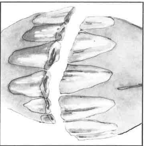
OFFSET OR DIAGONAL BITE