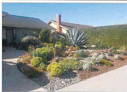
Carpinteria resident Deana Rae McMillion's front yard today is a garden artist's magnum opus.