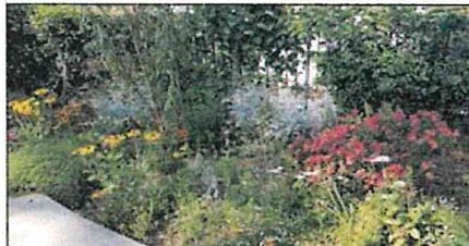
Bottom photo, meet the garden that "designs itself."

that's unfortunate. I think we're more self-absorbed than we have ever been. And I think a lot depends on the environment you find yourself in. In Los Angeles, it's more 'How can you help me?' than 'How can I help you?' In a place like Santa Barbara, hopefully we're more community oriented and a little friendlier."