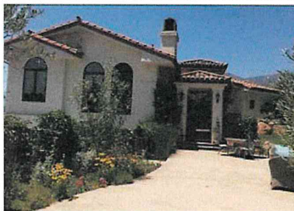
A flowery welcome awaits visitors near the Kravetz front door.