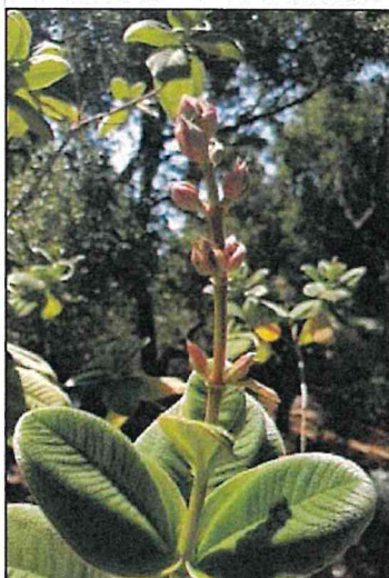
From top, the Hong Kong orchid tree brings a touch of the tropics; silvery agave leaves display distinctive patterns; regal princess flowers are ready to bloom.