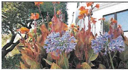
Top photo, orange cannas and blue agapanthus are a stunning combo.