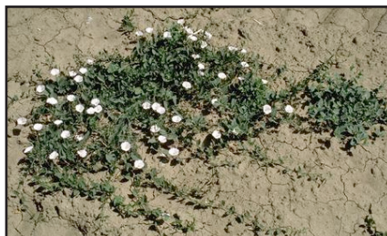
Figure 1. Field bindweed.

Field bindweed is a prostrate plant unless it climbs on an object for support. It often is found growing on upright plants, such as shrubs or grapevines, with its stems and leaves entwined throughout the plant and the flowers exposed to the light (Fig. 4). Under warm, moist conditions, leaves