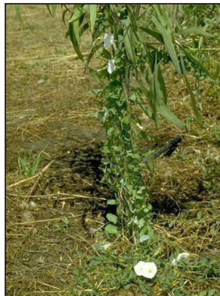
Figure 4. Field bindweed climbing up the stem of a shrub.

The root system has both deep vertical roots and shallow horizontal lateral roots (Fig. 5). The vertical roots can reach depths of 20 feet or more. However, 70% of the total mass of the root structure occupies the top 2 feet of soil. Most of the lateral roots are no deeper than 1 foot. Experiments on bindweed have shown that its root and rhizome growth can reach 2 1/2 to 5 tons per acre.