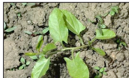
Figure 7. Field bindweed plants developing from underground roots or rhizomes don't have seed leaves.