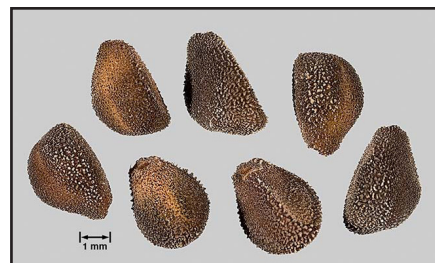
Figure 8. Field bindweed seeds.

bindweed propagules. It is important to control new infestations when they are small, because spot control is the least expensive and the most effective strategy.