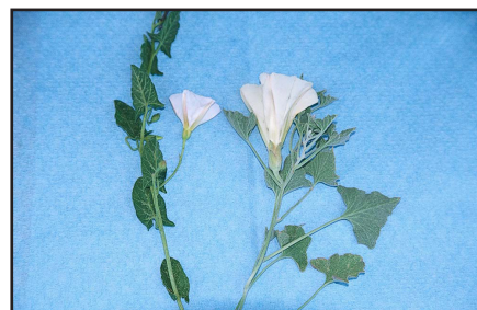
Figure 6. Field bindweed (left) and the larger flowers of western morningglory (right).

Three practices can reduce the possibility of introducing field bindweed—purchase and plant clean seed and ornamental stock, remove any seedlings before they become perennial plants, and prevent any plants from producing seed. If topsoil is introduced to a site, it should be free of roots, rhizomes, seeds, and other