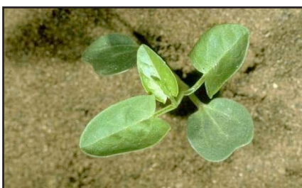
Figure 3. Field bindweed seedling.

are larger and vines more robust than under drought conditions.