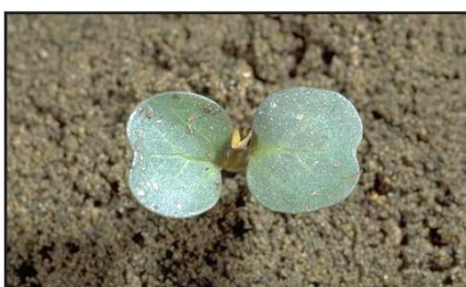
Figure 2. The first two leaves (cotyledons) of a field bindweed seedling are notched.