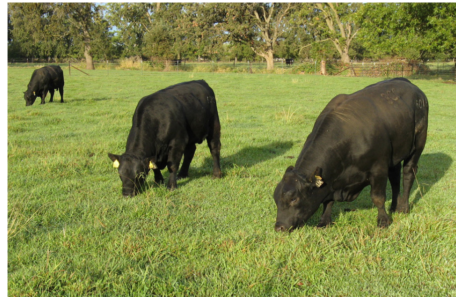
Figure 4. Bulls can consume 25% more forage than a cow. Semen-checking and culling bulls can save needed forage for cows.

Sections in the federal tax code—IRS Code Section 451(e) and 1033(e)—allow for the deferral of capital gains during a drought if cattle are replaced upon drought completion. The decision of which section to use depends on whether a drought designation has been declared in the affected area. In most cases, if beyond-normal culling is necessary, it is likely that a drought disaster has been