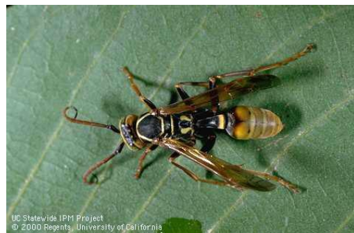
Adult yellow-legged paper wasp.

Paper wasps such as Polistes fuscatus aurifer , P. apachus , and P. dominulus are large (1 inch long), slender wasps with long legs and a distinct, slender waist. Preferring to live in or near orchards or vineyards, they hang their paper nests in protected areas, such as under eaves, in attics, or under tree branches or vines. Each nest hangs like an open umbrella from a pedicel (stalk) and has open cells that can be seen from beneath the nest. Larvae sometimes can be seen from below. Most species are relatively non-aggressive, but