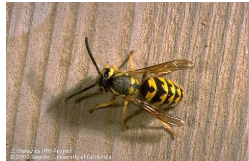
Adult western yellowjacket

The term yellowjacket refers to a number of different species of wasps. Included in this group of ground-nesting species are the western yellowjacket, Vespula pensylvanica , sometimes called the “meat bee,” and seven other species of Vespula . These wasps tend to be medium sized and black with jagged bands of bright yellow (or white in the case of the aerial-nesting D. maculata ) on the abdomen, and have a very short, narrow waist (the area where the thorax attaches to the abdomen).