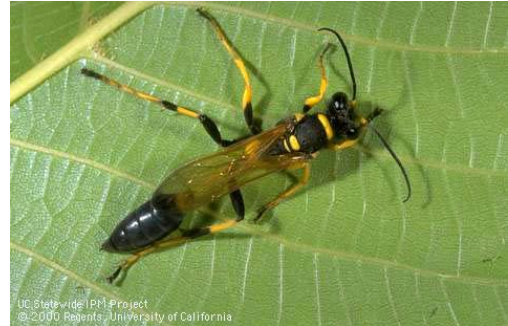
Adult mud dauber

Mud daubers are black and yellow, thread-waisted, solitary wasps that build a hard mud nest, usually on ceilings and walls, attended by a single female wasp. They belong to the family Sphecidae and are not social wasps but may be confused with them. They do not defend their nests and rarely sting. During winter, you can safely remove the nests without spraying.