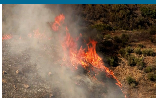
Fast-Moving 'Sherpa Fire' Forces Mandatory Evacuations in Santa Barbara County

The Soils/Water/Subtropical Program has a 60 year history of local research and extension that optimizes crop production, maximizes net farm income, conserves natural resources and protects the