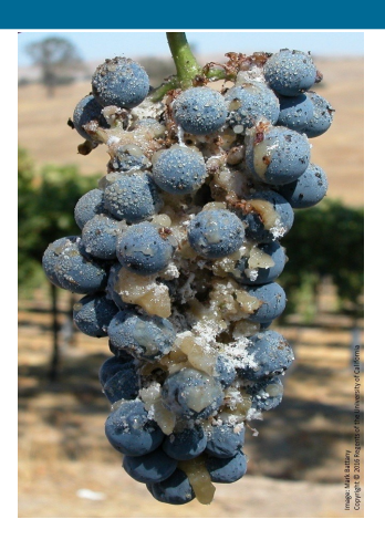
A cluster of Cabernet Sauvignon wine grapes heavily infested with the vine mealybug

The efficient management of irrigation water will become increasingly more critical in the future. Limitations of water supplies will force all farmers and other water users to generate the maximum possible returns from their available water.