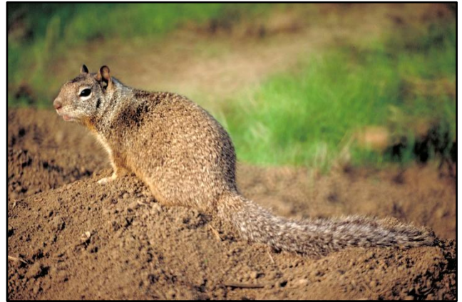
Figure 1: Photograph of California ground squirrel.

records of pest population levels, control measures implemented, and the effect of management methods, can be used to help determine the best management approach.