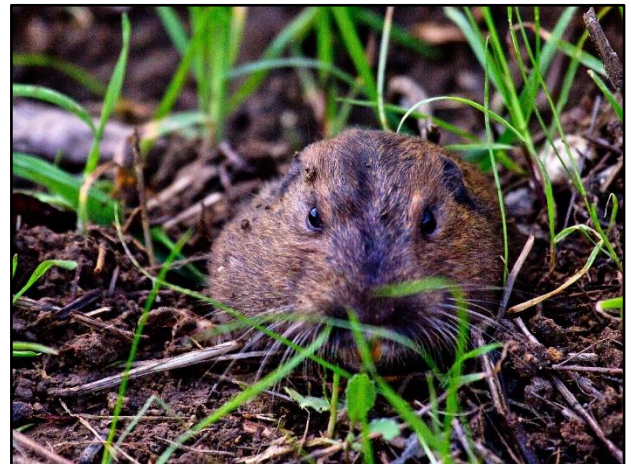
Figure 2: Photograph of pocket gopher.