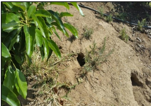
Figure 4: California ground squirrel burrow openings in an avocado orchard.