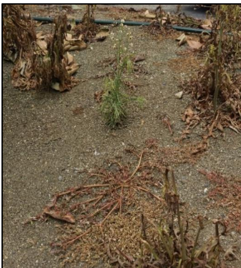
Photo 3. Signs of herbicide resistance.