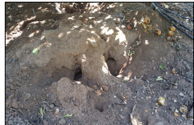
Figure 3: California ground squirrel burrow openings in a citrus orchard.