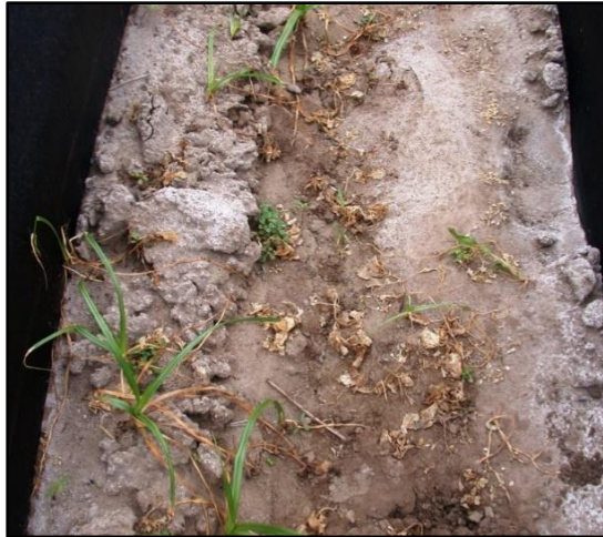
Figure. Weed control in strawberry furrows prior to planting with 9% by volume of fatty acid herbicide (left) and weeds in untreated check (right)