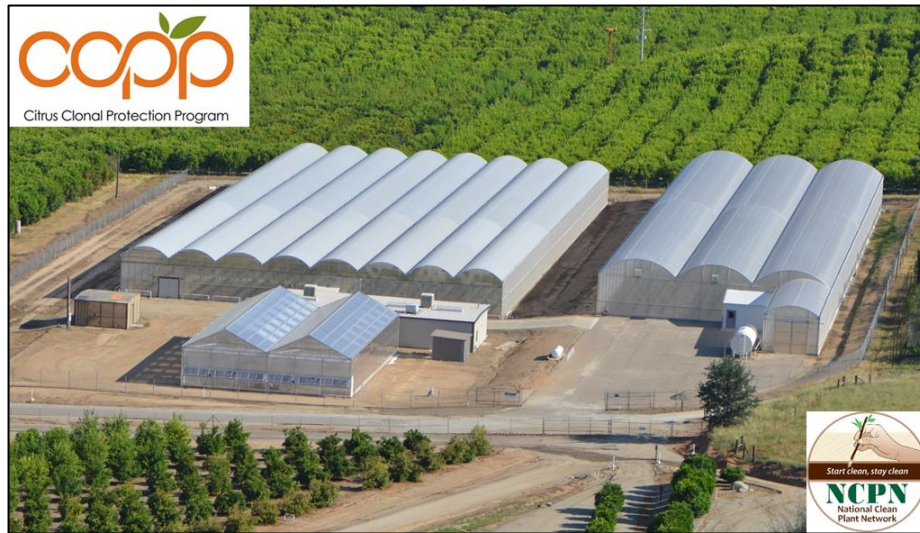
Figure 1 Panoramic view of the Citrus Clonal Protection Program foundation block operations at the Lindcove Research and Extension Center, Exeter, California.

To learn more about the CCPP, go to www.ccpp.ucr.edu and remember: CCPP is the place for starting citrus correctly.