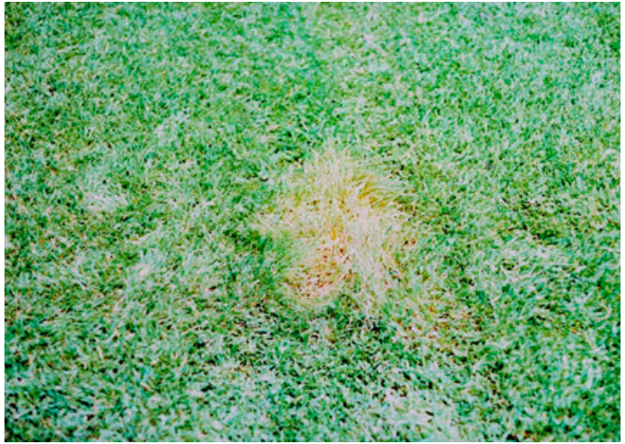
Figure 2. "Doggie spot" (lawn killed by dog urine). Older spots may remain dead, but the turf on the perimeter may turn dark green and grow faster due to nitrogen release.