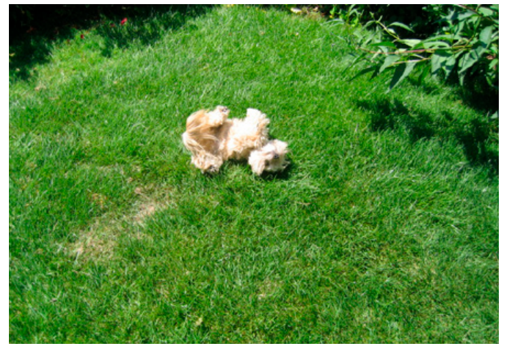
Figure 1. Dogs love to play on lawns!