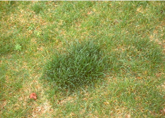
Figure 4. Where dog urine does not kill grass, its nitrogen causes plants to grow faster and darker than surrounding turf, compromising lawn uniformity.

ditions during or after the "event." If the burn is severe, however, the spots may need to be reseeded or resodded; otherwise, weeds may eventually replace the lawn grass on these spots.