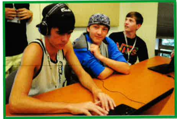
Working on a music mix in a DJ workshop with a fellow SLC Delegate . (above)

California 4-H State Leadership Conference at UC Santa Cruz! August 14-17, 2014 Leadership Participation: Delegate - Sacramento County