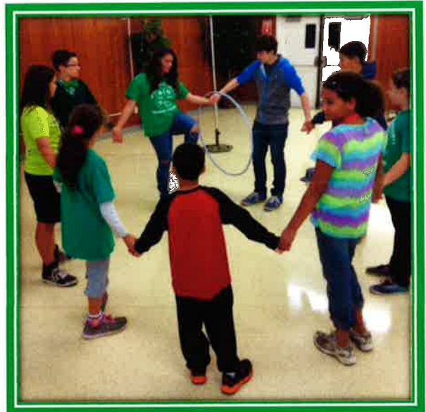
Playing an active group game at a Country Centre 4-H Club Meeting. In this game you all hold hands and then without letting go you have to move the hula hoop all the way around the circle. (above)