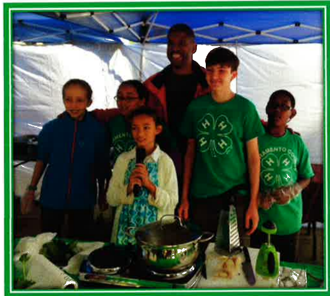
Posing with the Mayor of Sacramento Kevin Johnson as I compete in a Throw-down Showdown Cooking Challenge!