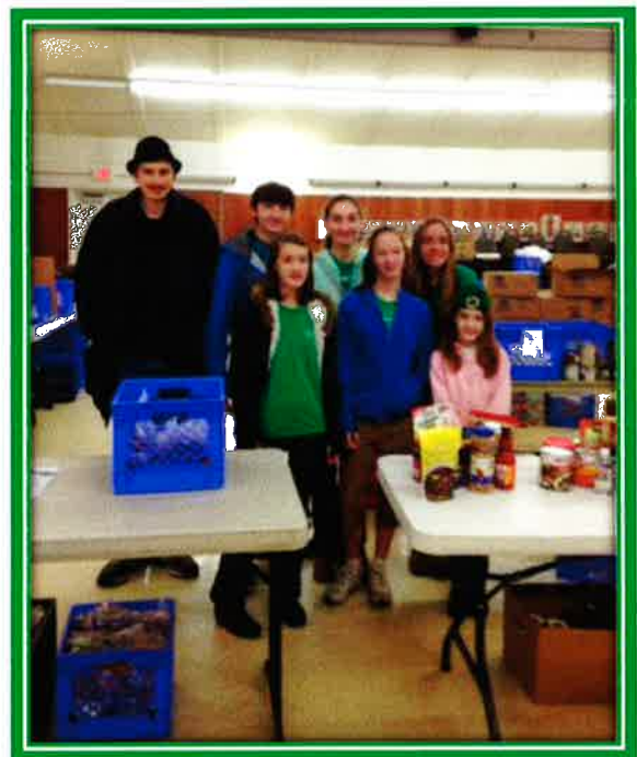
Country Centre 4-H Club members partner with Clover 4-H Club as we assist with the Sierra Arden Church Thanksgiving Food Distribution. (right)