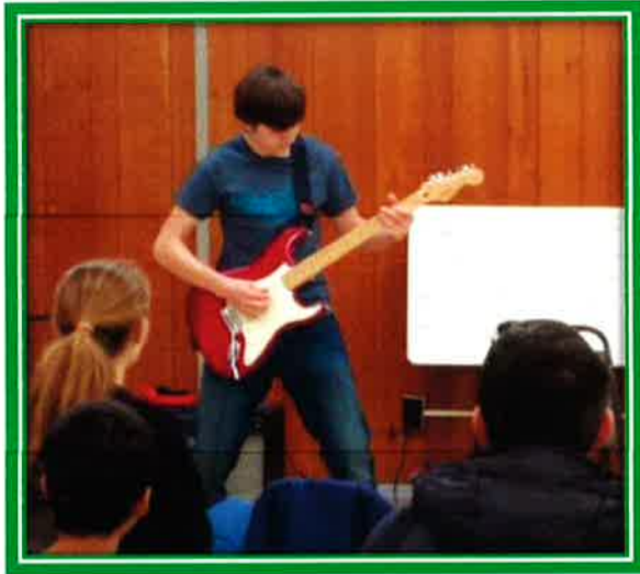
Performing Crazy Train by Randy Rhoads at The Country Centre 4-H Club Talent Night! (above)