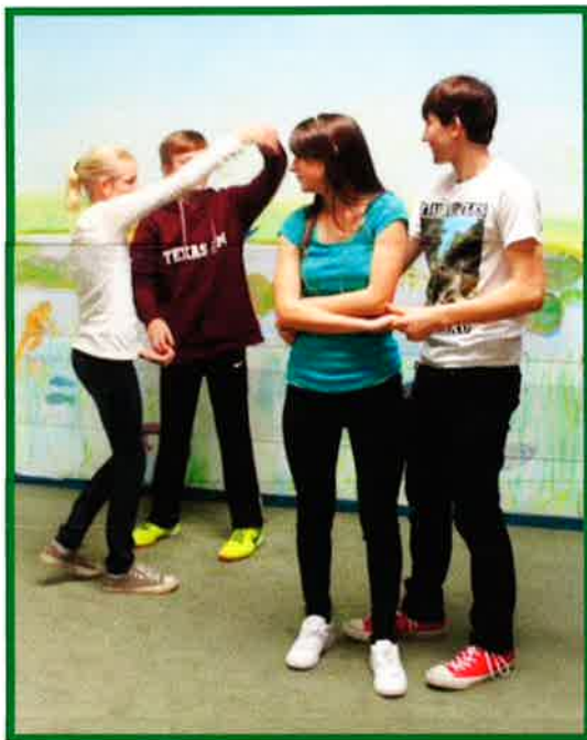
Sock Hop Swing Dance workshop. I am teaching an advanced move called the pretzel. (above - I am pictured on far right.)