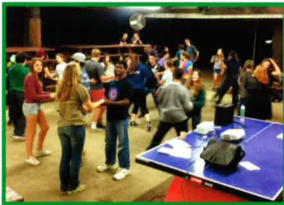
Teaching a Swing Dance Partner Dancing workshop with three fellow staff members. (above)