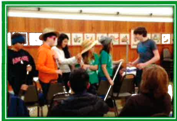
At a Leadership Development Project meeting I taught the officer team a skit. Here we are pictured performing the skit at a Country Centre 4-H Club meeting. (above)