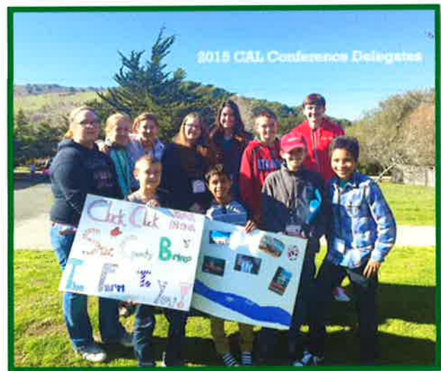
Sacramento County Delegates with the poster boards our group created for CAL, one shows our 'County Cheer' and one shows 'What makes Sacramento County Special'. (above - I am pictured in back row far right.)