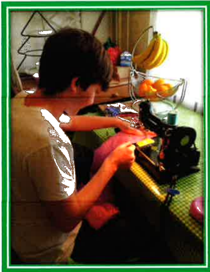
Sewing a pillowcase for the State Fashion Revue Fashion it Pillowcase Project . I hadn't sewed for 9 years.