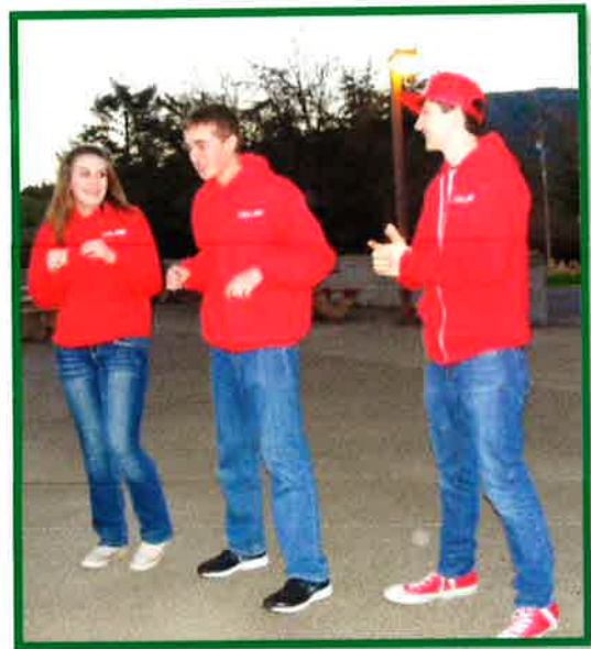
Leading a repeat after me song with the other Impromptu Recreation Staff. (above - I am far right.)