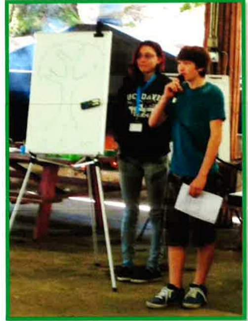
Leading a Checks and Balances workshop, I am talking about the government tree. (above)