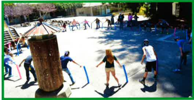
Playing a team building group game in a Team Building Game workshop. (above & left)