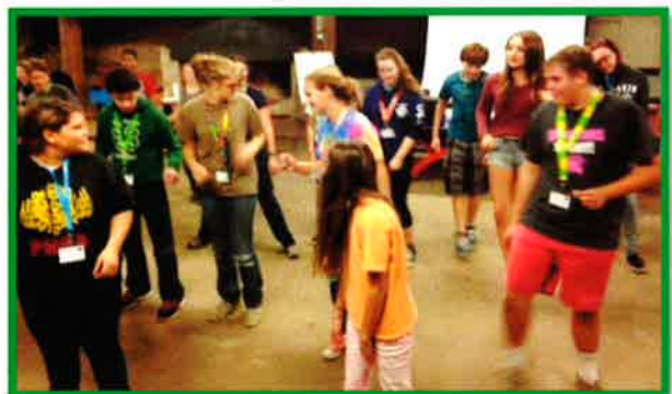
Time to teach my favorite group dance, the Sid Shuffle Continental Drift. (above)