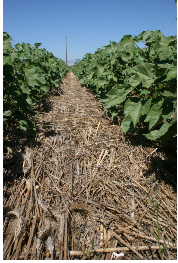
Figure 4. Cotton plants in no-tillage with cover crop experimental system in Five Points, CA

Table 4. Analysis of variance for cotton yields in STNO<sup>z</sup>, STCC<sup>y</sup>, NTNO<sup>x</sup>, and NTCC<sup>w</sup> systems in 2010, 2011, 2012, and 2013 in Five Points, CA