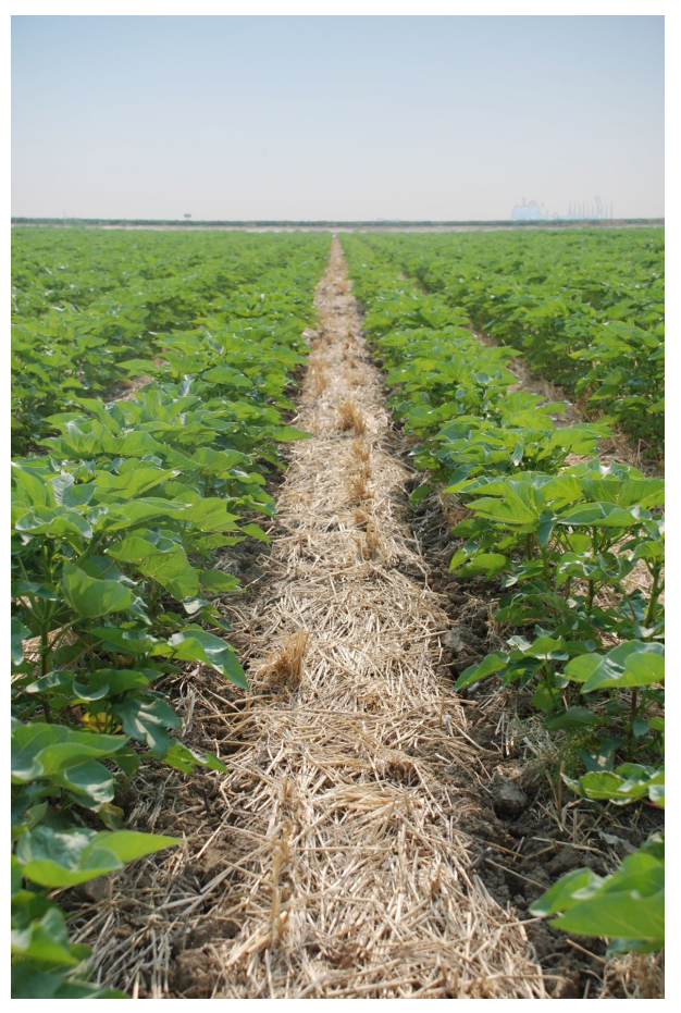
Figure 3. Cotton plants established in no-tillage with cover crop experimental system in Five Points, CA

Plant population was affected by year, but tillage and cover crop had no effect (Table 3). There were no significant year X tillage, year X cover crop, or year X tillage X cover crop interactions. Higher numbers of plants per hectare were achieved in 2013 than in 2011 (111,624 vs 99,587) despite similar seeding rates used for both years (Fig. 4). The plant populations achieved in both years for all treatments were within the optimal range of 74,000 to 123,000 plants /ha according to guidelines established by the UC Cooperative Extension for cotton (Kerby et al., 1996). Measurements of cotton plant height in 2011 showed no differences between tillage or cover crop systems (data not shown).