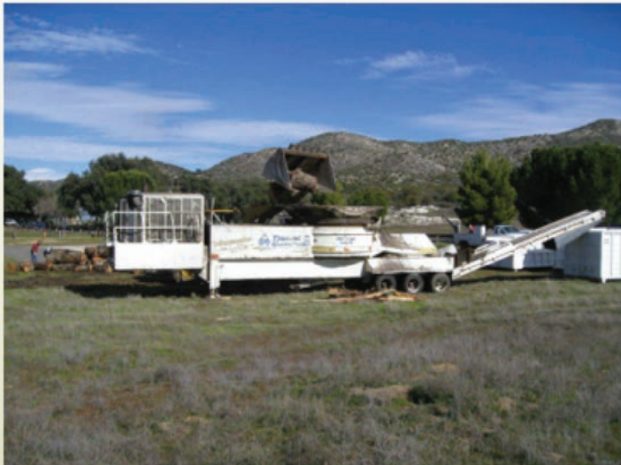
Commercial-sized tub grinders may be required to handle large pieces of oak.

Heat treatment of infested wood material at 160°F for a minimum of 75 minutes in an automated wood-drying kiln has been shown to eliminate many insects and diseases from firewood. These kilns have the capability of measuring and recording temperature time and duration well inside a pile of wood. However, no scientific study has been conducted to confirm that this temperature and time standard will kill GSOB.