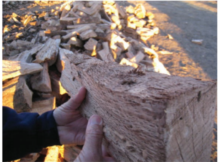
Debarked coast live oak firewood

Oak firewood that is free of bark will not transport GSOB. However, debarking can be very difficult to accomplish on “green” wood from recently killed trees; bark tends to come off the wood more easily over time as it dries out. If you choose the debarking option, make sure that the bark is stripped off all the way to the sapwood and not just the outer layer of bark is removed. Season, destroy or carefully dispose of the removed bark because it can still harbor borer larvae. Bark can be enclosed within plastic tarp, plastic bags or fine mesh window screen to allow it to season for two years. Make sure there are no seams or holes that would allow the beetles to escape.