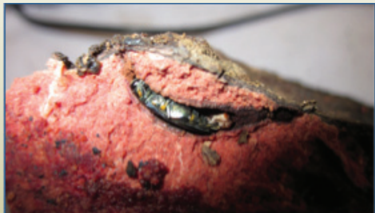
Left: GSOB larva preparing a pupation chamber near the outer bark.