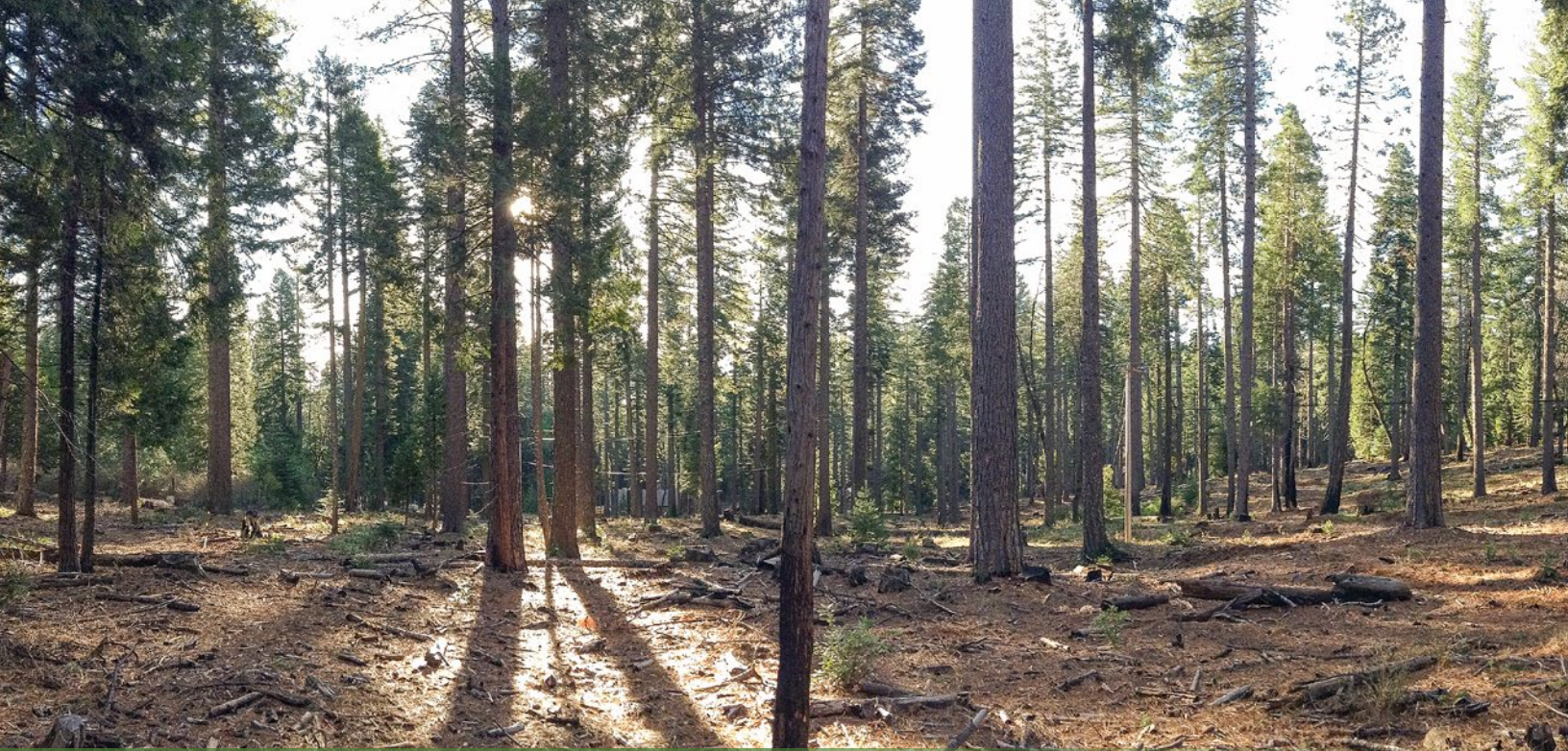
Above, a forest stand at Blodgett Forest Research Station treated with uneven aged, 75% slash utilization forest management.

improve with better technologies and financial incentives.