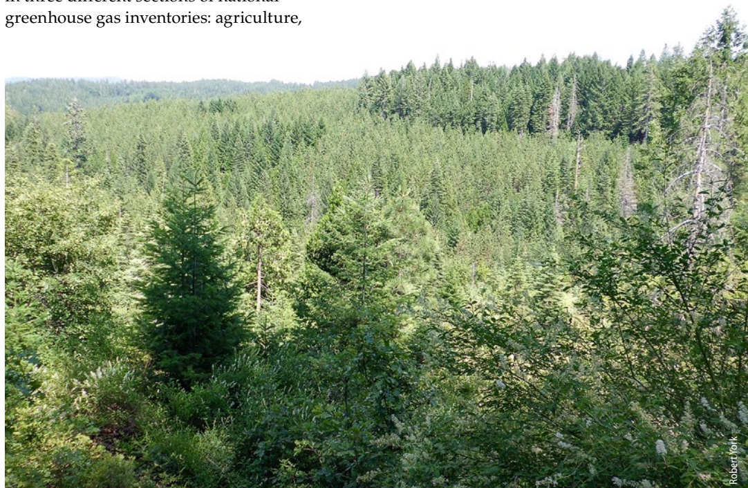
UC researchers have developed a tool that helps users understand how forest management options will affect carbon sequestration. Above, managed stands of mixed-conifer forest in the Sierra Nevada.

forests and other land uses (AFOLU); energy systems; and buildings (IPCC 2006). At the federal level, greenhouse gas inventories, emissions and net sequestration are tracked for forests, wood products in use and wood products deposited in landfills. Emissions from wood used for bioenergy are not included in national emission totals since they reduce the need to burn fossil fuels (US EPA 2014). Sequestration benefits of using wood for bioenergy depend on fossil fuel displacement and how the bioenergy utilization is integrated with overall forest management (Malmshemer et al. 2011; Smyth et al. 2014). At the state level, California's 2014 Climate Change Scoping Plan mentions the positive benefits of using more wood products in construction and more wood chips to generate energy, but the accounting framework and recommended policies focus only on increasing carbon inventories in the forest (California Air Resources Board 2014).