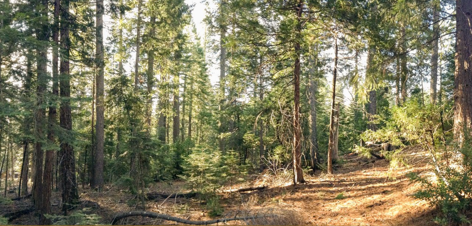
The increase in carbon stands over time in a let-grow forest, above , is based on the observed rate of live tree carbon by stand age.

Foresters who submit timber harvest plans in California face the challenge of demonstrating compliance with California’s numerous climate-oriented laws even though different carbon accounting systems can produce conflicting results and the relevant laws are complex in their aims. In 2010, AB 1504 revised the intent of the Z’Berg Nejedly Forest Practices Act regulating nonfederal forest lands to ensure both of these goals: “(a) Where feasible, the productivity of timberlands is restored, enhanced, and maintained. (b) The goal of maximum sustained production of high-quality timber products is achieved while giving consideration to values relating to sequestration of carbon dioxide, recreation, watershed, wildlife, range and forage, fisheries, regional economic vitality, employment, and aesthetic enjoyment” (California Code of Regulations 2010). In addition, the state’s forests are diverse; they vary considerably in terms of dominant tree species, ownership and productivity (table 1).