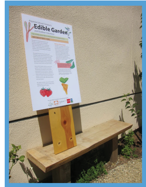
Create visible signage that explains the vision for your school garden and helps advertise upcoming events.

As the year winds down, a careful evaluation of the program during the past year will help you build on what works in the outdoor classroom, and rethink what doesn't. Ask all teachers who participated in the program to fill out a carefully crafted evaluation form. Try to ask questions that can't just be answered with a simple yes or no. If teachers can't find the time to fill out an evaluation, schedule a time to sit with them and debrief about the year. Evaluations over time are valuable, and will help guide the program so that it improves from year to year.