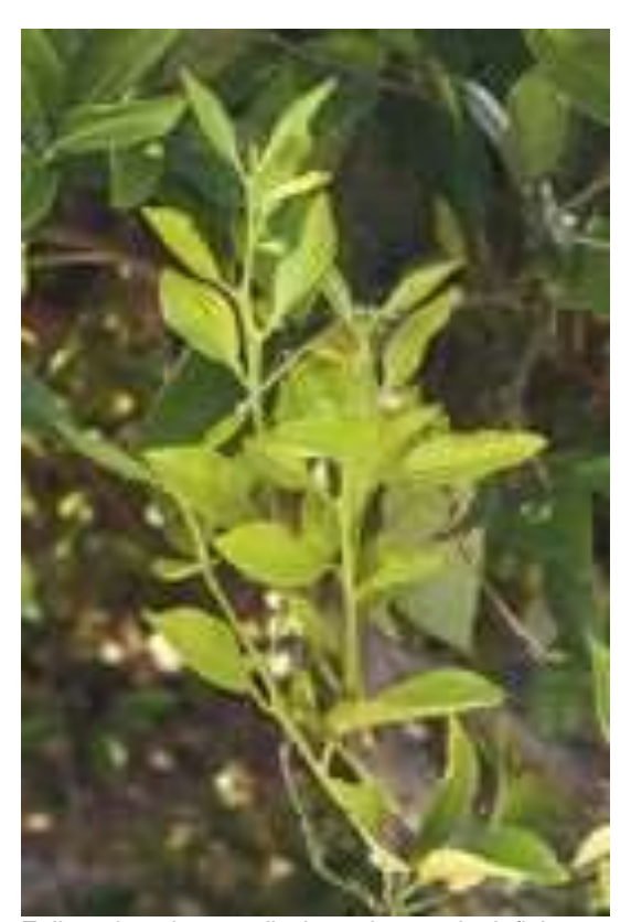
Foliage is pale overall when nitrogen is deficient

When trying to assess what might be the cause of the chlorosis it's important to step back and observe the whole tree. Where are the yellow leaves? On part of the tree, on new growth or on