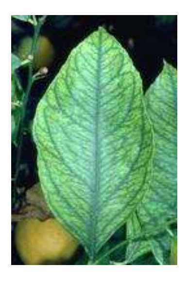
Interveinal chlorosis from iron deficiency appears as yellowing between the small, darker green veins