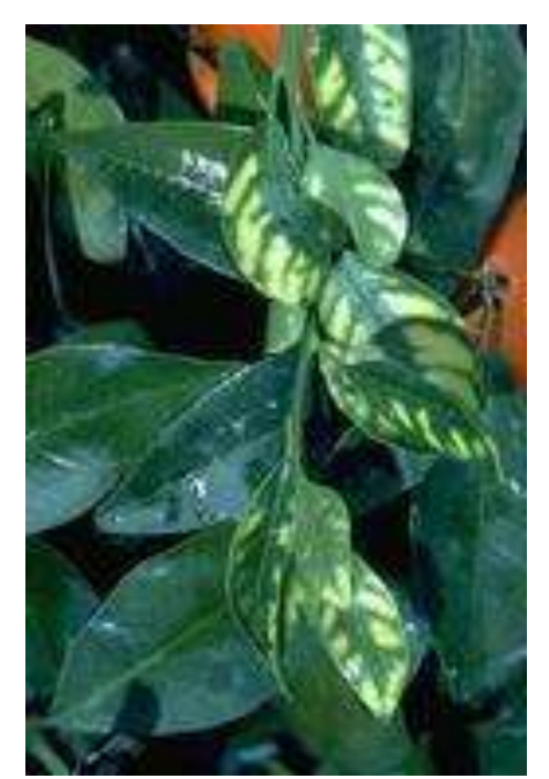
Extensive chlorosis develops between veins when zinc is severely deficient;

Citrus may occasionally suffer from a deficiency of zinc, iron or manganese. The plants uses these nutrients in very small amounts but they are