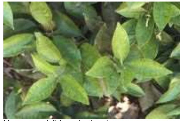
Manganese deficiency in citrus leaves appears as broad pale areas between green veins causing foliage when viewed from a distance to have a mottled appearance overall.

Citrus are heavy feeders and need a regular supply of nutrients especially nitrogen. Fertilizing with nitrogen is recommended three times a year with the first application in February and the remaining applications at 4 to 6 week intervals. Citrus planted in lawns will probably not get enough nitrogen from fertilizer applied to the lawn. The grass will take up most of the nitrogen so additional fertilizer for the tree is needed.