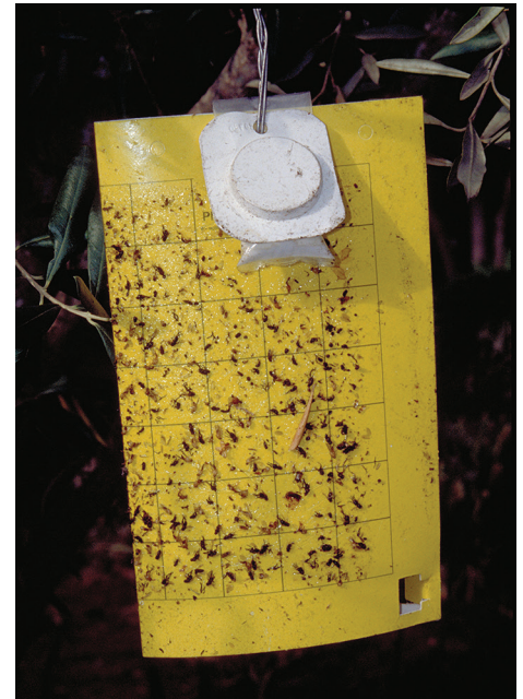
Figure 1. Comparison of OLF Trap Types (Fly Catches) 2003-2005