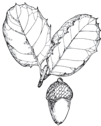
Fig. 166. Quercus agrifolia Née. Leaves, fruit, \times \frac{3}{4} .