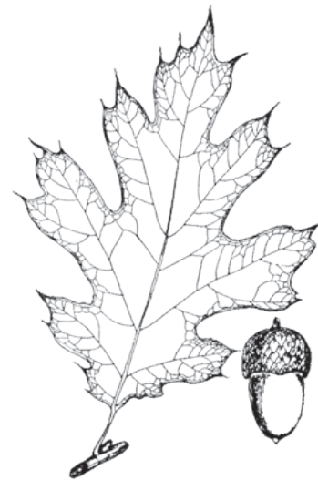
Fig. 178. Quercus kelloggii Newb. Leaf, fruit, \times \frac{3}{4} .