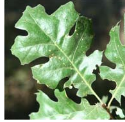
California Black Oak