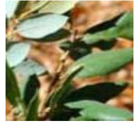
Canyon Live Oak