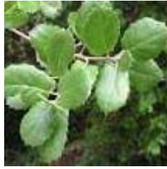
Coast Live Oak

Match the leaf to the picture on the right and circle the species name of the oak tree.