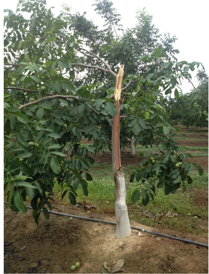
“Broken Mess” (1 tree out of 200 acres)