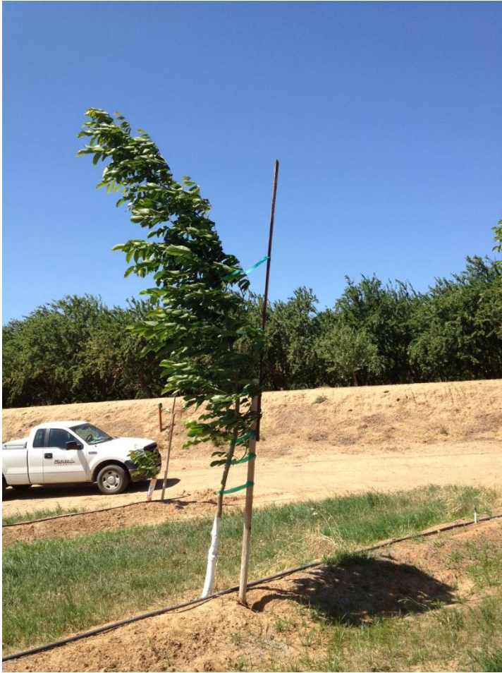
Wind Storm in May (No Broken Scaffolds)