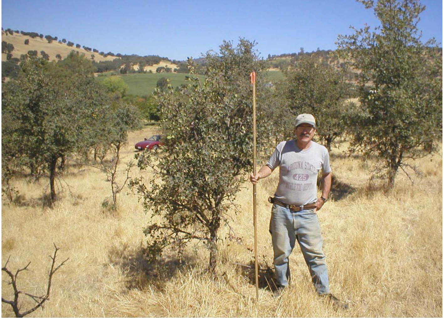
Decades of research at SFREC have helped to establish guidelines for regenerating oaks in grazed woodlands. Staff research associate Jerry Tecklin demonstrates that blue oaks more than 6.5 feet (2 meters) tall are relatively resistant to cattle impacts, while seedlings shorter than 6.5 feet are adversely affected.

each, so using them over large areas would likely be prohibitively expensive for most private landowners. Cost-share programs (that help subsidize the cost of purchasing and installing tree shelters) to encourage hardwood restoration are common in Great Britain and other parts of Europe, but are generally not available in California (McCreary and Kerr 2002).