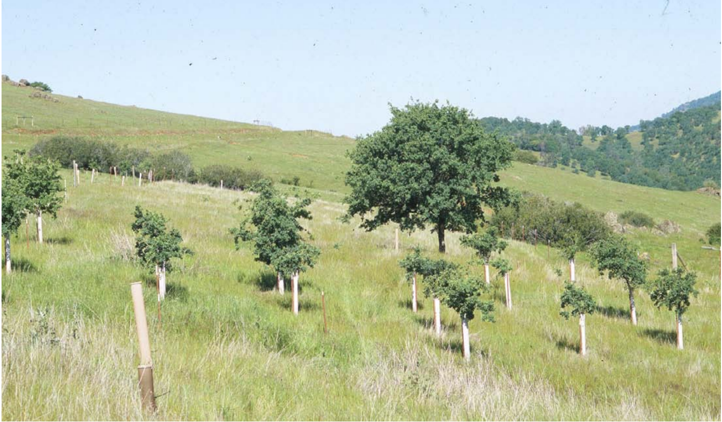
Tree shelters helped to get blue oak seedlings established and growing rapidly in an oak regeneration plot at SFREC.

soilborne organisms.) They discovered that oaks and pines have a diverse fungal community on their roots that aids in nutrient uptake. Mycorrhizae also play a critical role in oak establishment (Berman and Bledsoe 1998), water uptake (Millikin and Bledsoe 1999) and nitrogen capture (Cheng and Bledsoe 2004).