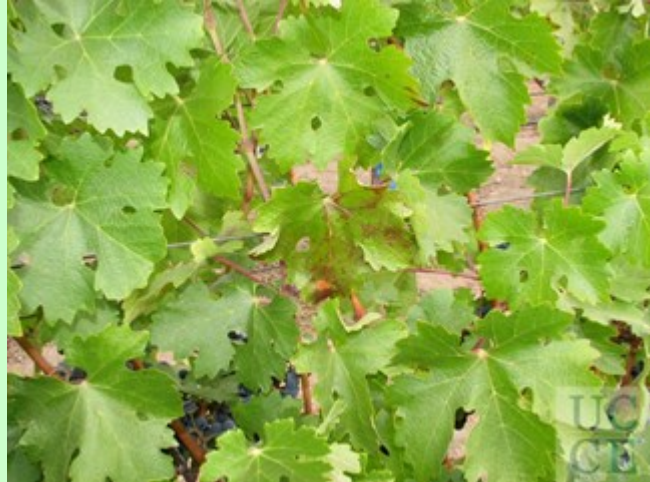
Figure 1. Cabernet Sauvignon displaying Red Blotch from 2013. More photos of symptomatic leaves can be found on the web here .

Next generation sequencing may identify a new virus in a diseased grapevine; however it does not mean the virus caused the disease. Grapevine Syrah virus (GSyV-1) is an example of a virus that was identified in a Syrah vine with Syrah decline; however thus far the virus has not been shown to cause syrah decline disease or any other disease in grapevines.)