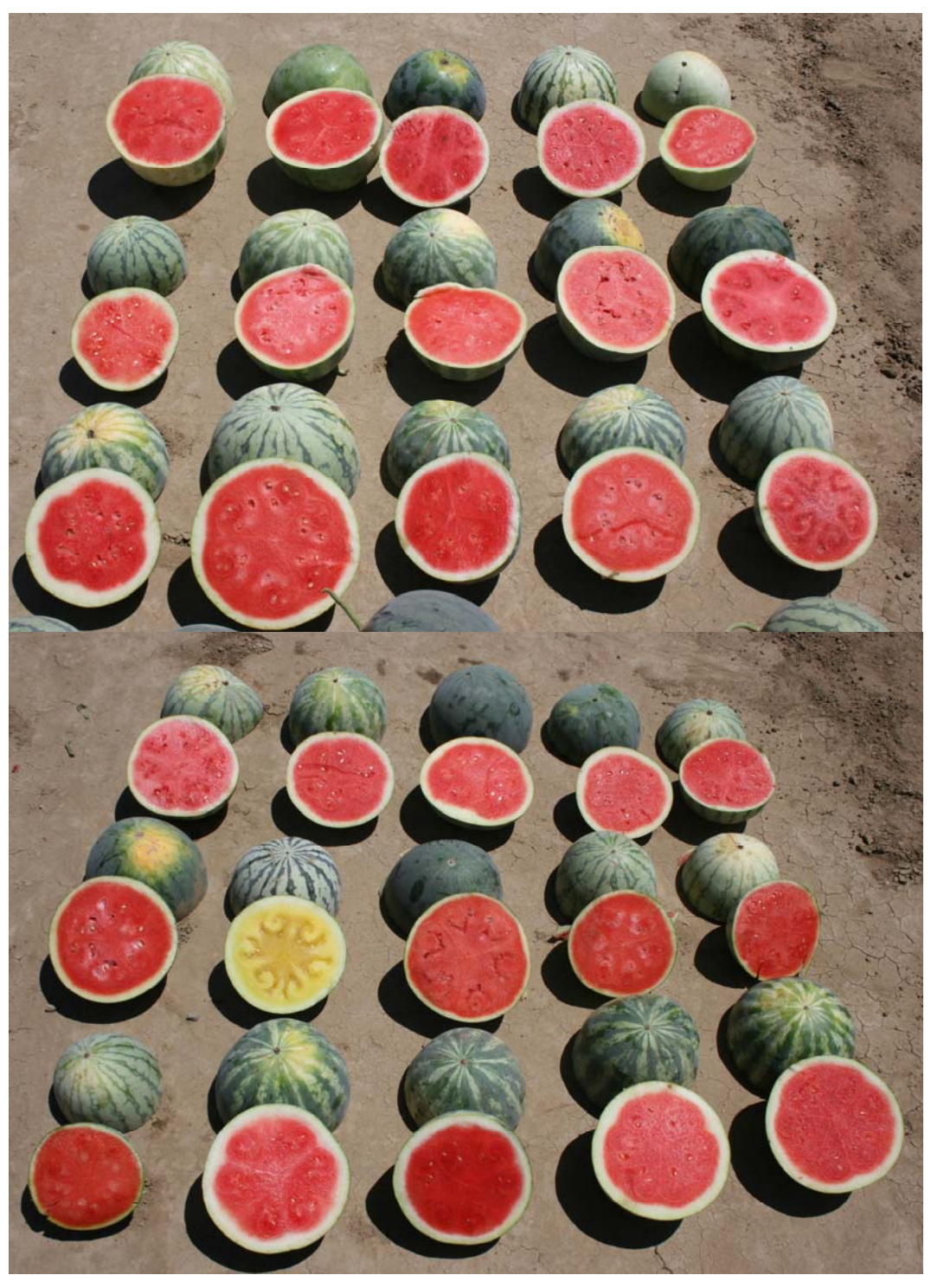
Figure 2. Entries in the trial for evaluation of yield and quality of personal watermelon varieties under conditions in western Fresno County on 25 Aug 2008. Entries appear sequentially by treatment number as listed in Table 1 from left to right, back to front.