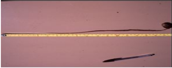
An oak seedling tap root removed from the soil in February

Coast Live Oak need 6 to 8 months to produce an acorn, primarily because it takes that long for the tree to fill and acorn with all the material a new seedling needs. What sets acorns apart from other seeds is the amount carbohydrate they carry for root development. Acorns germinate in the fall, when rainfall starts to saturate the ground. Seedlings have to develop a good root system before the rains stop in April, but don't produce any shoots and leaves above ground until February or March. So all the energy for root growth must be provided by storage rather than photosynthesis – and this is why acorns have to be so large. When an acorn germinates, a single root (called a radical) splits the tip of the acorn (away from the cap). Radicals follow gravity, and develop for 4 to 6 months before a seedling breaks ground. If roots encounter no obstacles, they can grow over 6 feet into the ground to reach reliable sources of water.