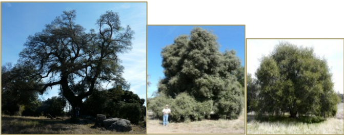
Left: coast live oak Center: intermediate hybrid Right: interior live oak

There are over 28 varieties of oaks in southern California, from small shrubs to 80 ft tall trees. But the coast live oak ( Quercus agrifolia ) is most common and emblematic of California's cultural heritage. It's one of three red oaks (sub-genus Lobatae ) in our region. You may also observe shrub-form oaks (interior live oak - Q. wislizeni ) and hybrids between coast and interior live oak, but these aren't attacked by as many pathogens and insects and don't need our help.