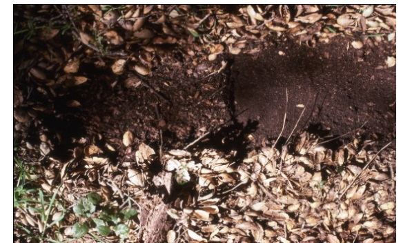
Oak leaf litter, oak duff, and mineral soil

We can help the natural process of oak regeneration in a number of different ways. Oaks trees come from seedlings and new seedlings come from germinated acorns. But it's not just the right conditions to get a new seedling started: (1) acorns have to be produced because a high proportion are eaten by mammals, birds, and insects, or attacked by disease; (2) surviving acorns have to end up at a safe site in the ground to germinate; (3) acorns have to maintain enough internal moisture to germinate and then find enough soil moisture to survive; and finally (4) they have to grow past a number of years to finally join the woodland canopy. So today we're going to nudge the process along by increasing the number of acorns in a declining woodland, moving them to the ground before they lose too much moisture, and giving them slightly better conditions to germinate and grow.