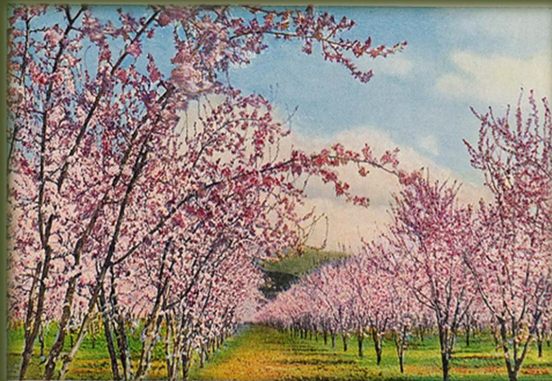
A PRUNE ORCHARD IN BLOOM, CALIFORNIA