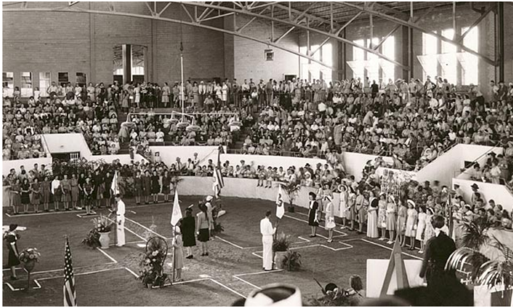
Nebraska State Fair 4-H Style Show, 1940

The early Fashion Competitions & Revues extended to County Fair Competitions, and eventually to State Fair Competitions and Style Shows.