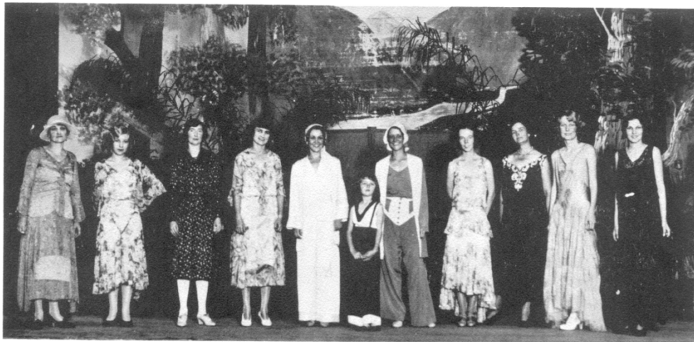
Florida 4-H Fashion Revue of years past

The 4-H Fashion Revue is a well-loved, long-standing tradition, and not only is it interesting, but important, to know a little bit about its history--why we do it, and what skills can be learned from participating in this fun and exciting event.