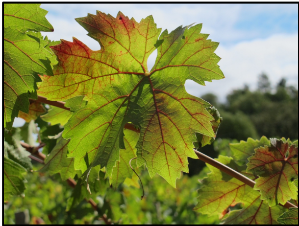
Red blotch and red veins on a leaf of Cabernet Franc grapevine.

DISEASE SYMPTOMS: The symptoms generally start appearing in late August through September as irregular blotches on leaf blades on basal portions of shoots. The secondary and tertiary veins turn partly or fully red. Occasionally, the reddening of leaf blade in the interveinal zones between secondary veins resembles those of leafroll diseases, but the leaf margins do not roll downward. Also, in leaf-roll affected red varieties the secondary and tertiary veins remain green. It is not known if the disease has any effect on fruit yield, and cause vine decline. The most significant impact of the disease appears to be on the Brix units of the berries. Brix of grapes in vines showing red blotch symptoms has been found to be 4 to 5 units lower than those with green canopies and this difference is higher than those normally seen in leafroll-affected grapevines.