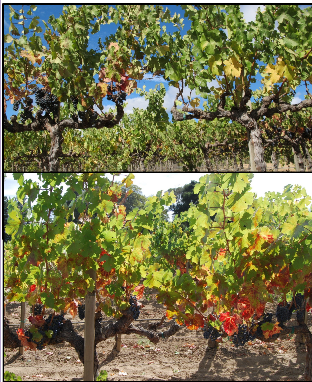
Cabernet Franc grapevines showing red blotch disease (top left and bottom) and harvested normal grapevine (top right), October 2012.

associated with diseased grapevines from vineyards planted with Cabernet Franc, Cabernet Sauvignon and Zinfandel and this new virus has been proposed to be called as ‘Grapevine red blotch-associated virus’ (GRBaV). In PCR assays, this new virus has been found consistently associated with symptomatic grapevines. A virus originally called- Grapevine cabernet franc-associated virus, similar to GRBaV, has been found in vineyards in New York and Pennsylvania by researchers at Cornell University. Also, a genetically identical virus has been found in grapevines in Canada.