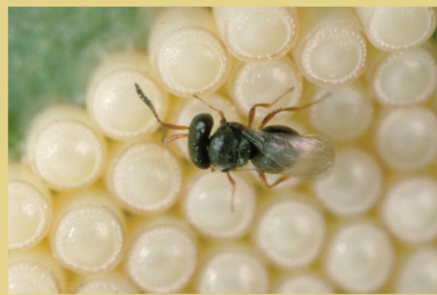
Some parasites attack insect eggs, such as the Trissolcus species wasp.

Parasites live and feed in or on a larger animal (host). Nearly all insect pests have at least one parasite that attacks them. Insects that parasitize other invertebrates (sometimes called parasitoids) are parasitic only in their immature stages and kill their host just as they reach maturity. Most insect parasites are host-specific wasps or flies, and many are so small that often you won't see them. An adult parasite can lay eggs in hundreds of host individuals with a resulting quick reduction in pest numbers.