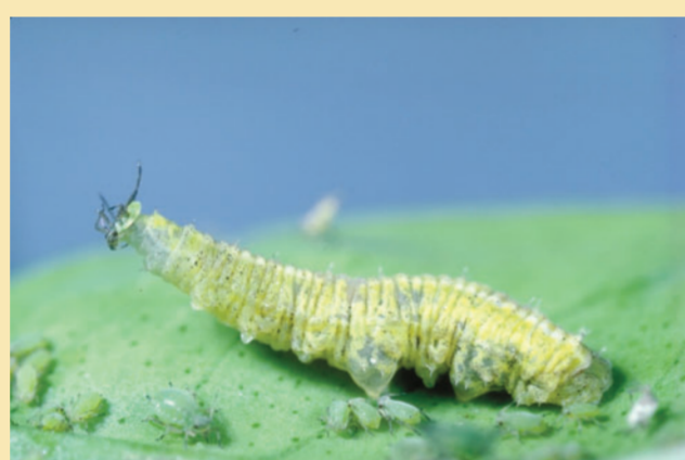
Syrphid fly larvae eat mostly aphids but also soft-bodied insects.