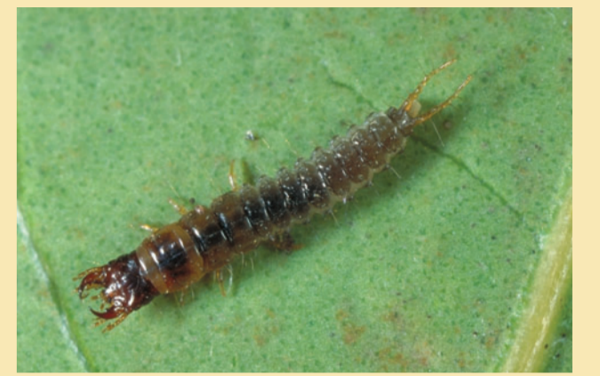
Predaceous ground beetle larvae live on soil and in litter, feeding on almost any invertebrate.