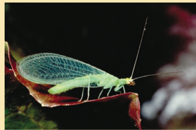
Green lacewing adults eat nectar and pollen. Some species also eat insects.