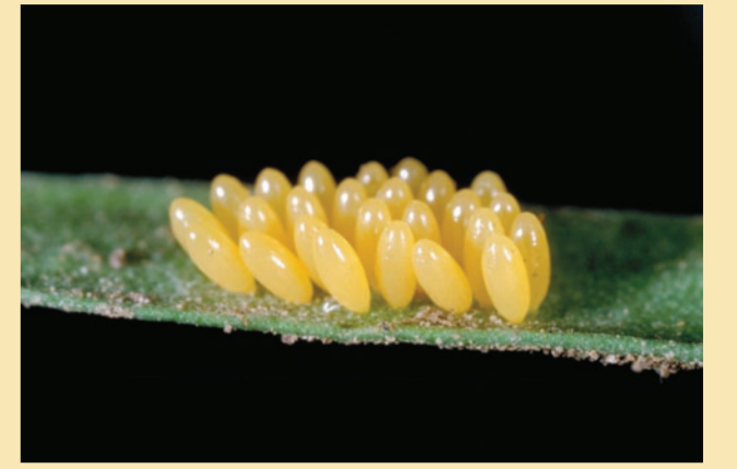
Convergent lady beetles prefer to eat aphids but sometimes eat whiteflies and other soft-bodied insects. Shown here are the adult (left), larva (center), and cluster of eggs (right).