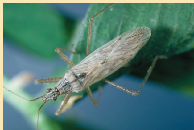
Damsel bugs are predaceous on a wide variety of small insects.