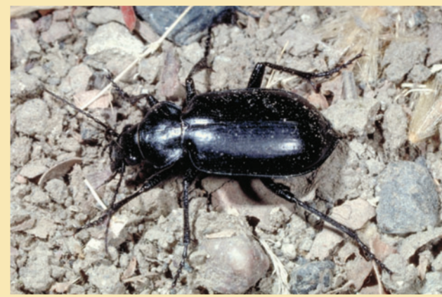
Predaceous ground beetle adults stalk soil-dwelling insects, such as cutworms and root maggots.