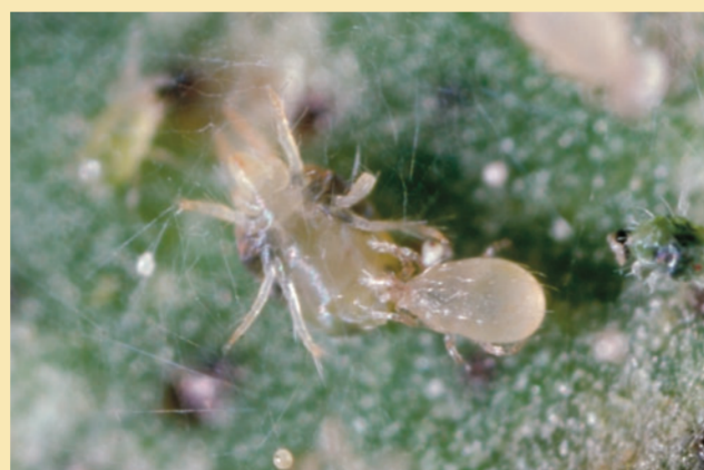
Western predatory mites attack pest mites.