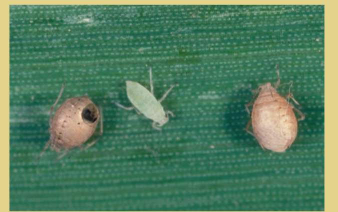
Parasitized aphids die and turn into crusty "mummies" that can be black or beige. The hole in the mummy at left indicates a parasite has emerged. The aphid in the middle is healthy.