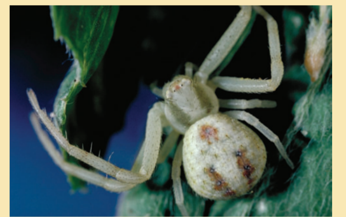
Spiders , including this crab spider, attack all types of insects.