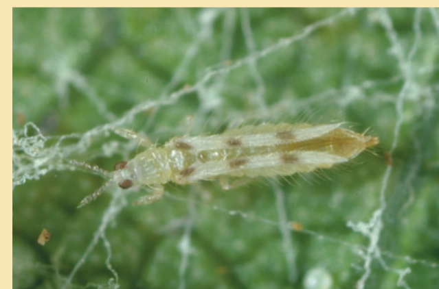
Sixspotted thrips attack mostly mites.