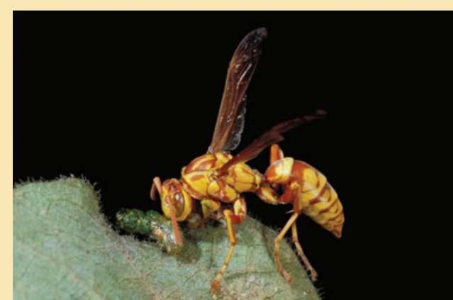
Adults of predatory wasps , such as this paper wasp, prey on caterpillars and other insects.