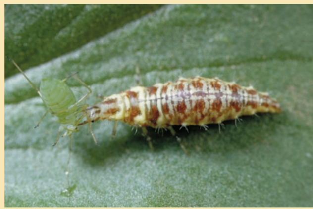
Green lacewing larvae feed on mites, eggs, and small insects, especially aphids.