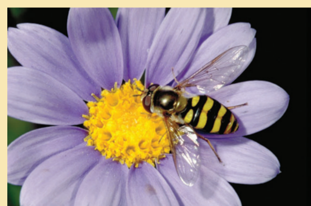
Syrphid fly (flower fly, hover fly) adults eat pollen and nectar.