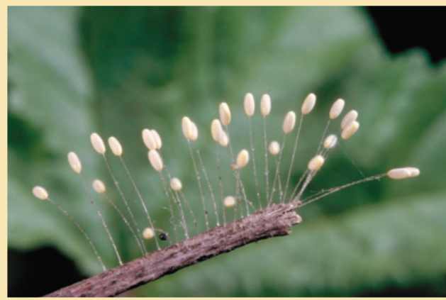
Green lacewing eggs are laid on slender stalks in groups (as shown here) or individually.