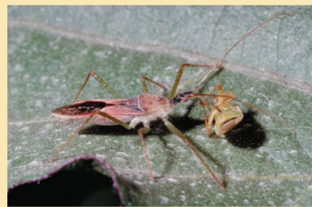
Assassin bugs attack almost any insect.