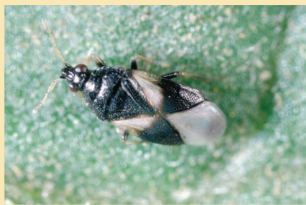
Pirate bugs attack mites and any tiny insect, especially thrips.