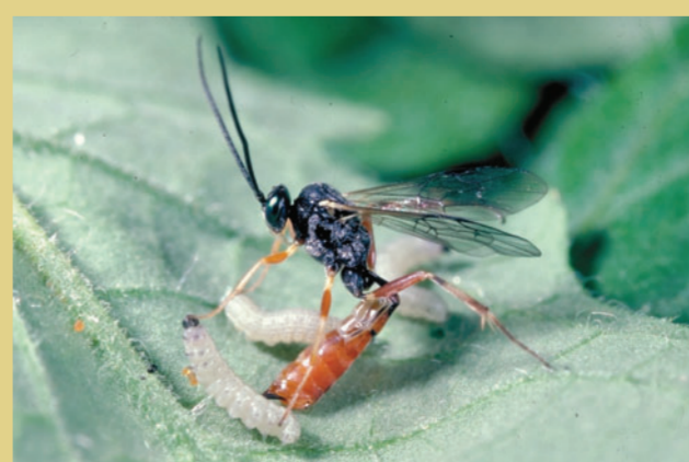
Caterpillar parasites include the Hyposoter exiguae wasp.