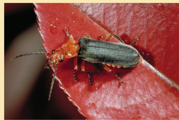
Soldier beetle adults eat mostly aphids; their larvae are soil-dwelling.