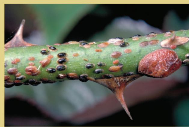
The blackish scale insects have wasp larvae developing within.