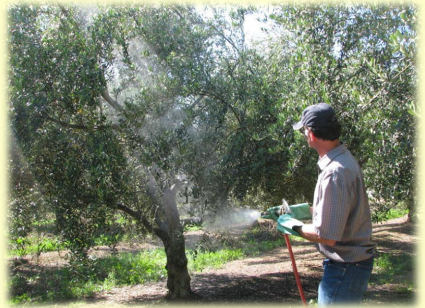
Demonstration using Kaolin clay (Surround) as a full coverage spray