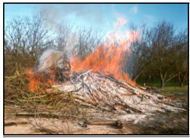
Notes: Cooking fires in the field or burning money paper at Hmong funeral services are permissible and require no burning permit. (Pg. 28, Rule 4103)

Effective 2010, a burn permit will no longer be issued.