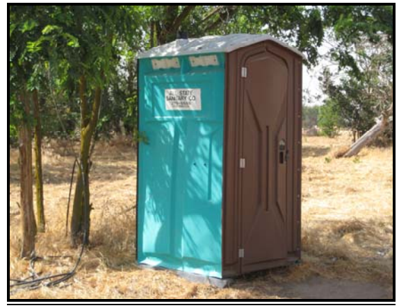
Fig. 1 – Mobile Toilet at Sarn Saechao's Strawberries Farm

Cal/OSHA consultation is free of charges. Cal/OSHA keeps all finding confidential, and reports its findings to the Enforcement Division only if the employer repeatedly fails to take proper corrective actions<sup>18</sup>