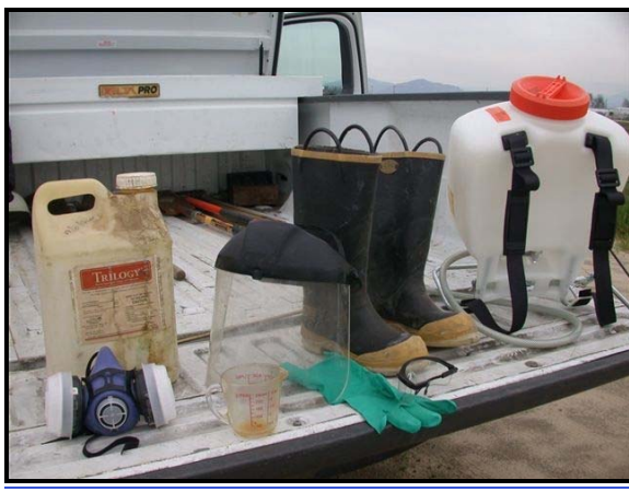
Recommended minimum protection