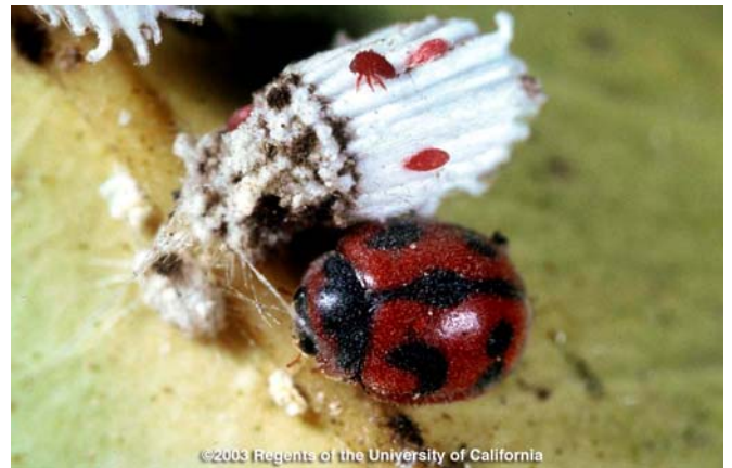
Photo 1. Vedralia beetle adult, eggs, and larva feeding on cottony cushion scale.

Carman, 1989). At peak use on citrus in California (1930-1940), as much as 6 million pounds of liquid HCN was used in a single season (Carman, 1989). This era was also characterized by numerous examples of rather high quality observational research focused on various aspects of pest taxonomy, basic biology, and ecology of citrus pests. In addition, classical biological control solved a number of pest outbreaks caused by the introduction of exotic citrus pests into California from various regions of the world. The science and philosophy of classical biological control originated with the outstanding control of cottony cushion scale achieved following the introduction of the vedalia beetle (Photo 1) and the Cryptochaetum fly into southern California citrus groves in 1888 (Doutt, 1958; Quezada and DeBach, 1973; Clausen, 1978). This led to the establishment of strong research units emphasizing biological control of pests of citrus and other crops at both Berkeley and Riverside within the University of California system.