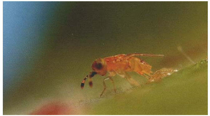
Photo 3. Metaphycus helvolus parasitizing a soft scale.

During the pesticide era, growers and pest control advisors in coastal and interior citrus growing regions of southern California, often working in cooperation with researchers from the Citrus Experiment Station (CES) at Riverside,