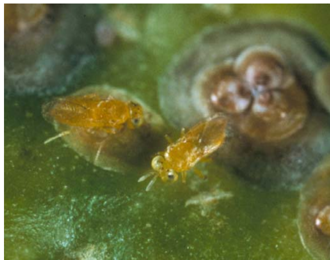
Photo 2. Aphytis melinus wasps parasitizing California red scale.