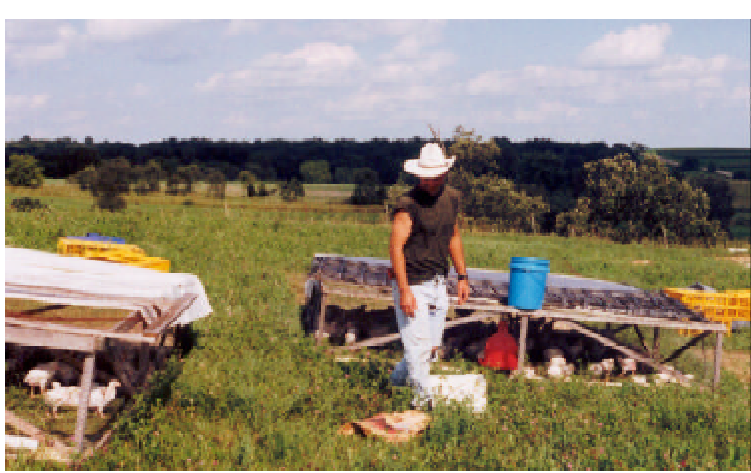
A farmer checks on his pastured poultry pens.

The model of a 5,000-bird operation (a primary enterprise) showed annual net returns to labor and management of over $18,000 in its tenth year. This would involve a 35 to 42 hour work week