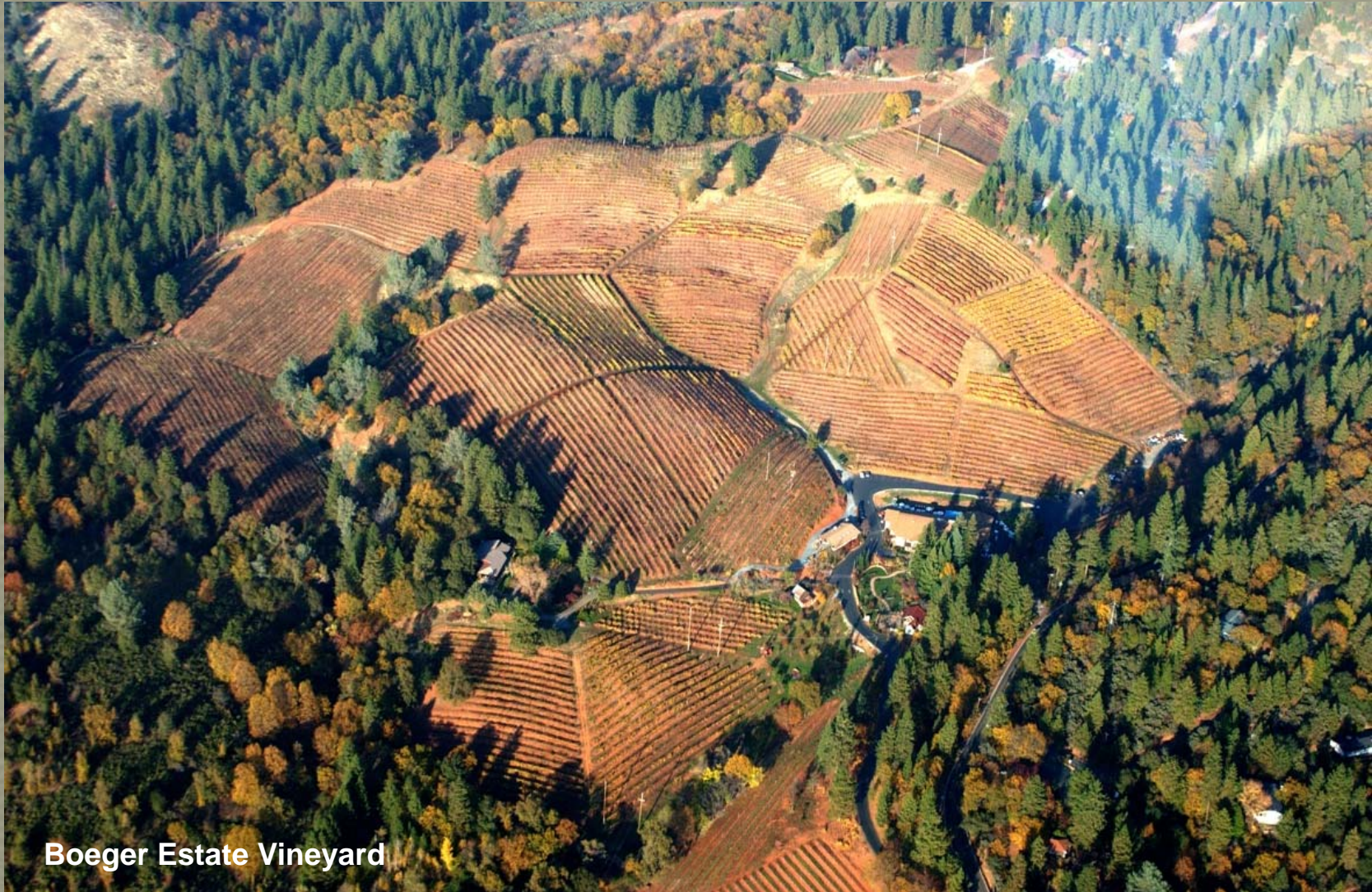
Boeger Estate Vineyard