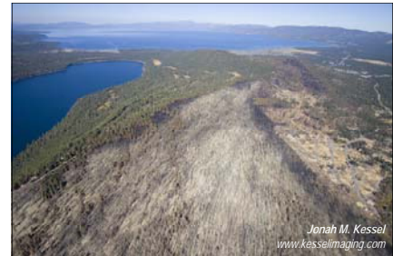
The Angora area burn scar.

The University of California Cooperative Extension (UCCE) invites you to participate in a neighborhood planning process to create a set of voluntary landscaping guidelines for the Angora burn area. The goal of this project is to develop a vision for a future landscape that integrates defensible space, water quality, wildlife, and aesthetic values.