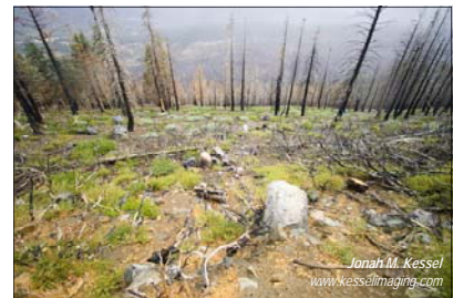
New growth in the Angora Burn area.

In Spring 2009, Forest Service urban lots burned by the Angora Fire will be replanted. The National Forest Foundation has awarded funding to the Nevada Tahoe Conservation District (NTCD) and the Tahoe Resource Conservation District (Tahoe RCD) to assist the US Forest Service Lake Tahoe Basin Management Unit in the creation of a Forest Stewardship Program that will plant, maintain, and monitor these replanted urban lots. There will be several planting days in the spring, followed by the establishment of a maintenance and monitoring program to ensure tree survival.