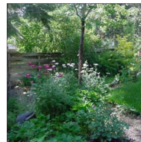
A Tahoe native garden is a great alternative to turf.