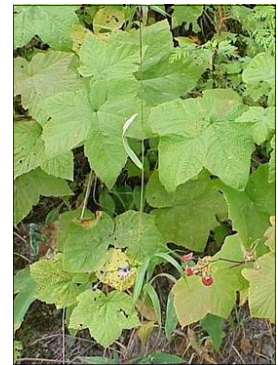
Thimbleberry is one of Tahoe's native species.

Tahoe Resource Conservation District BCP Hotline: (530) 543-1501 ext. 113, info@tahoercd.org OR Attend the January 28th meeting listed on page 1.